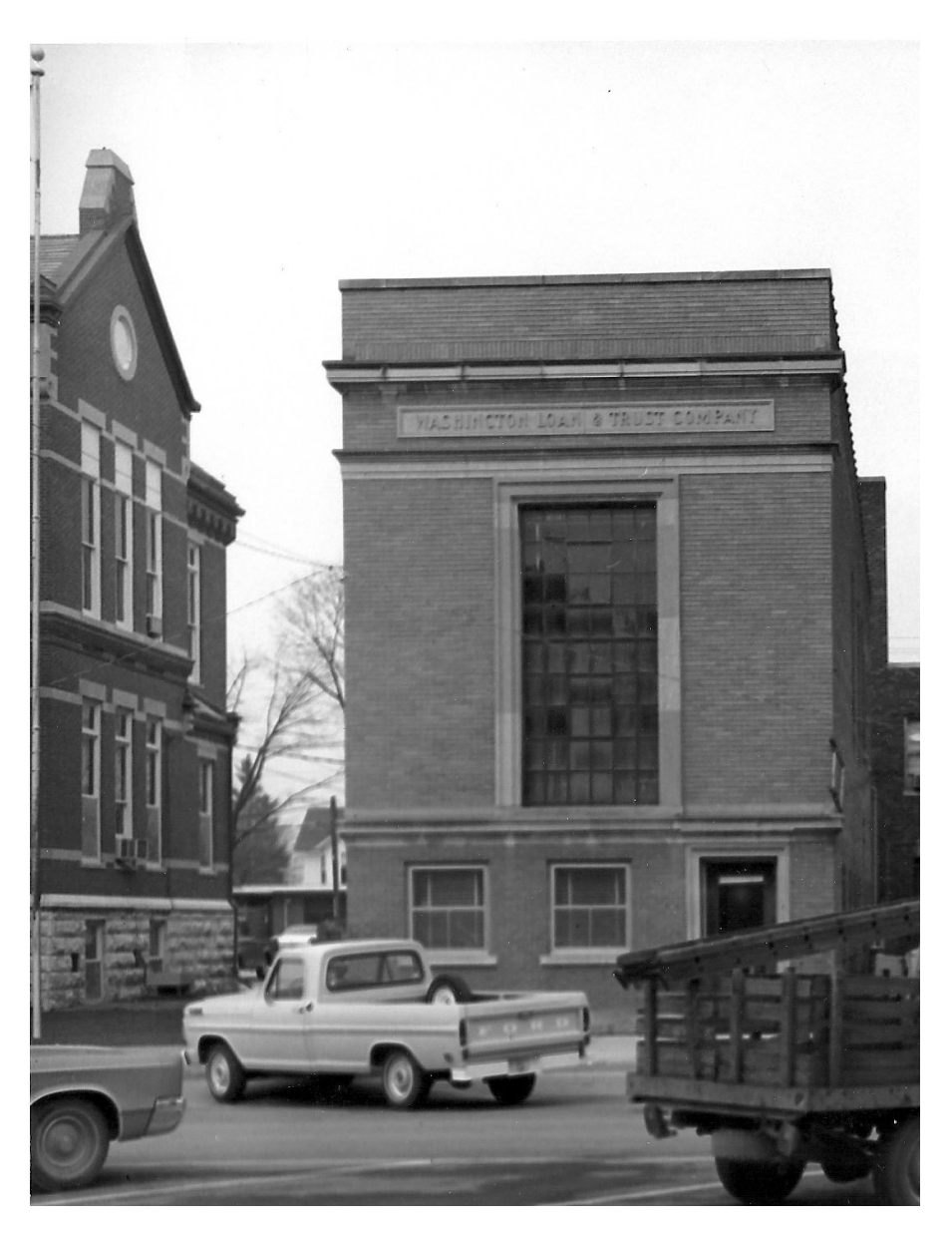
Building in 1971 (Wagner 1971).

Washington Loan & Trust Company Washington Name of Property County 210 West Main Street Washington Address City