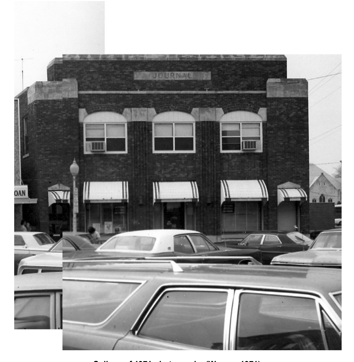
Collage of 1971 photographs (Wagner 1971).