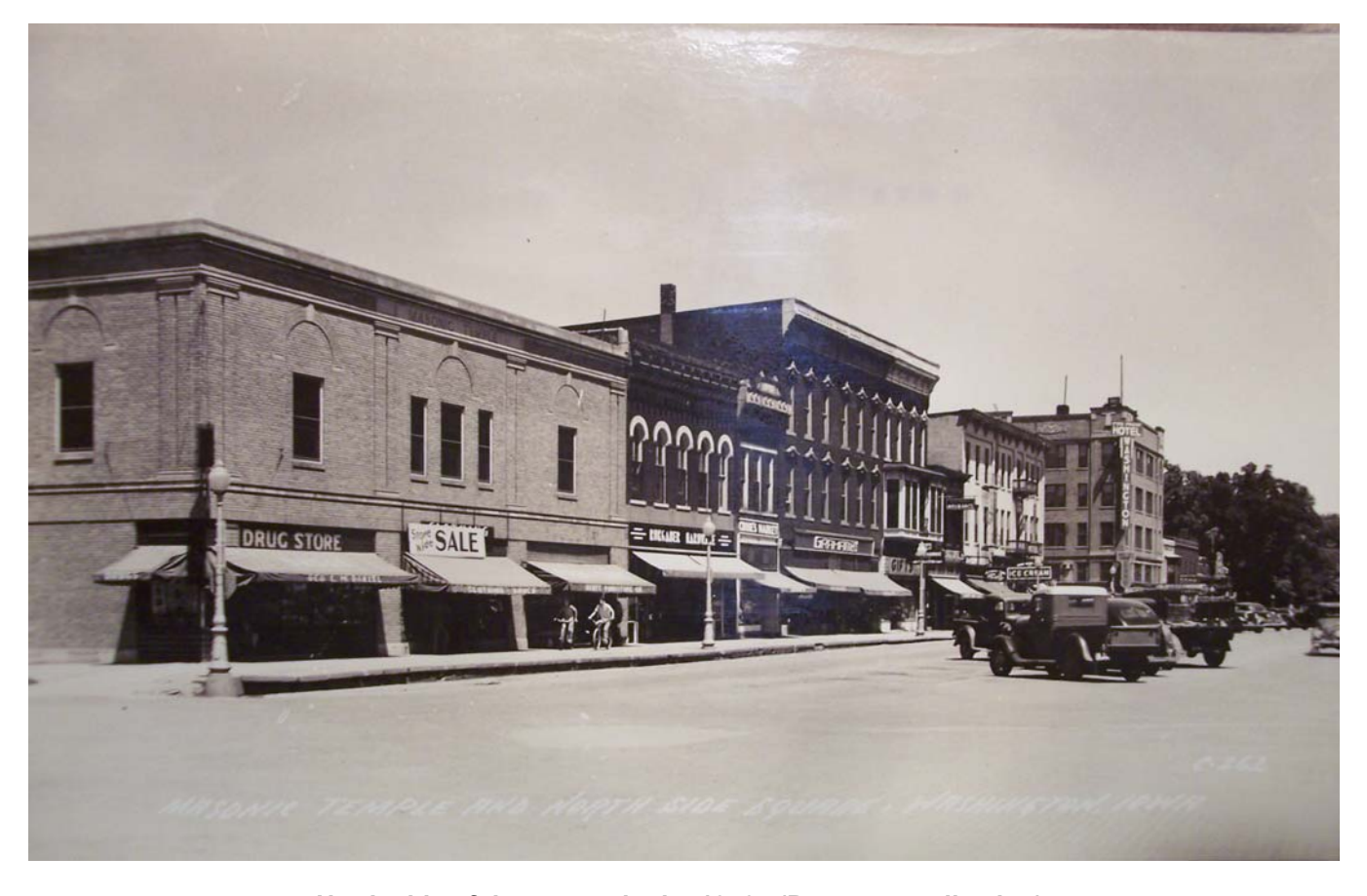
North side of the square in the 1940s (Patterson collection).