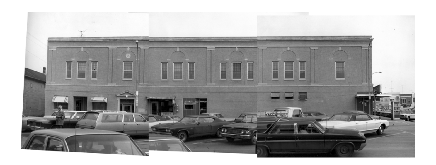
Collage of 1971 photographs of building (Wagner 1971)