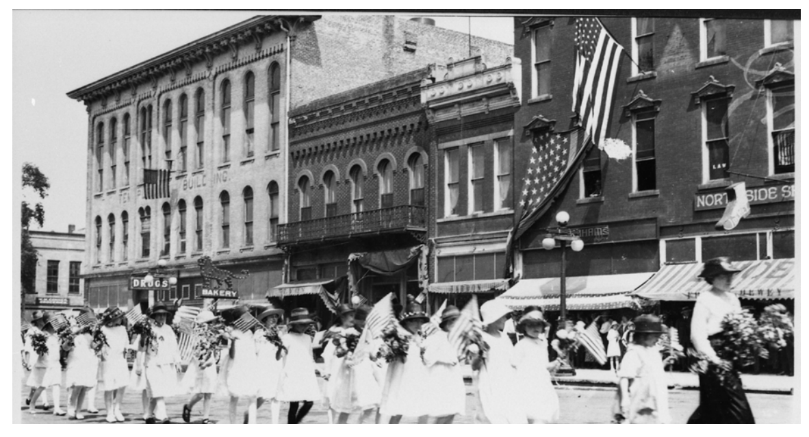
North side of square around 1918.