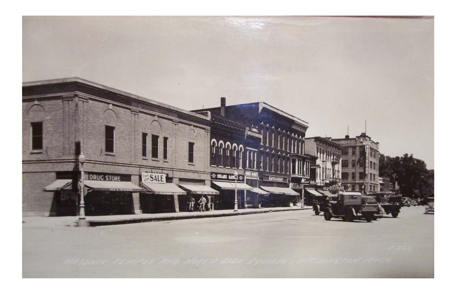
North side of square in 1940s.