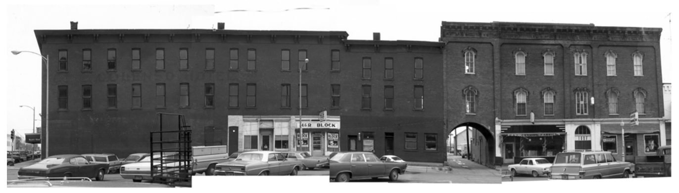
Side of original building