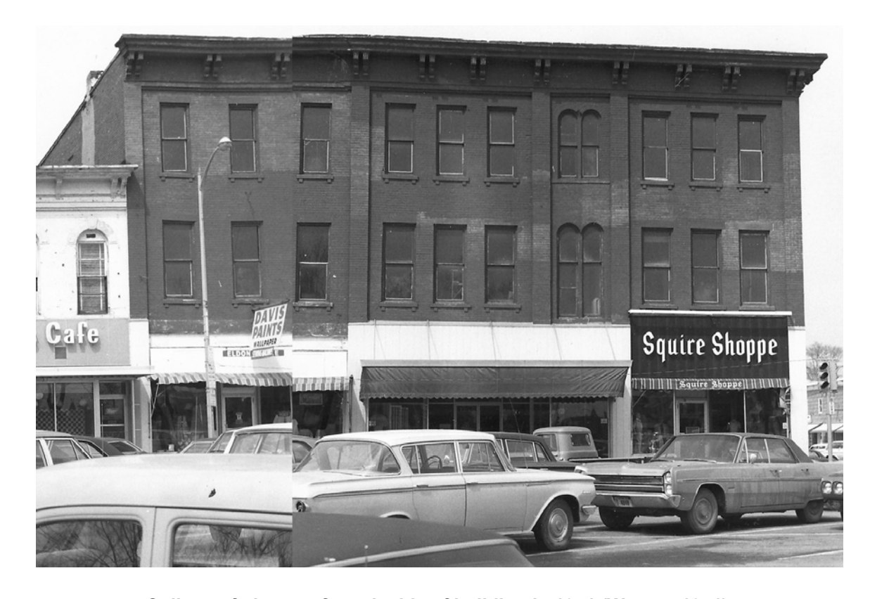
Collage of photos of south side of building in 1971 (Wagner 1971).