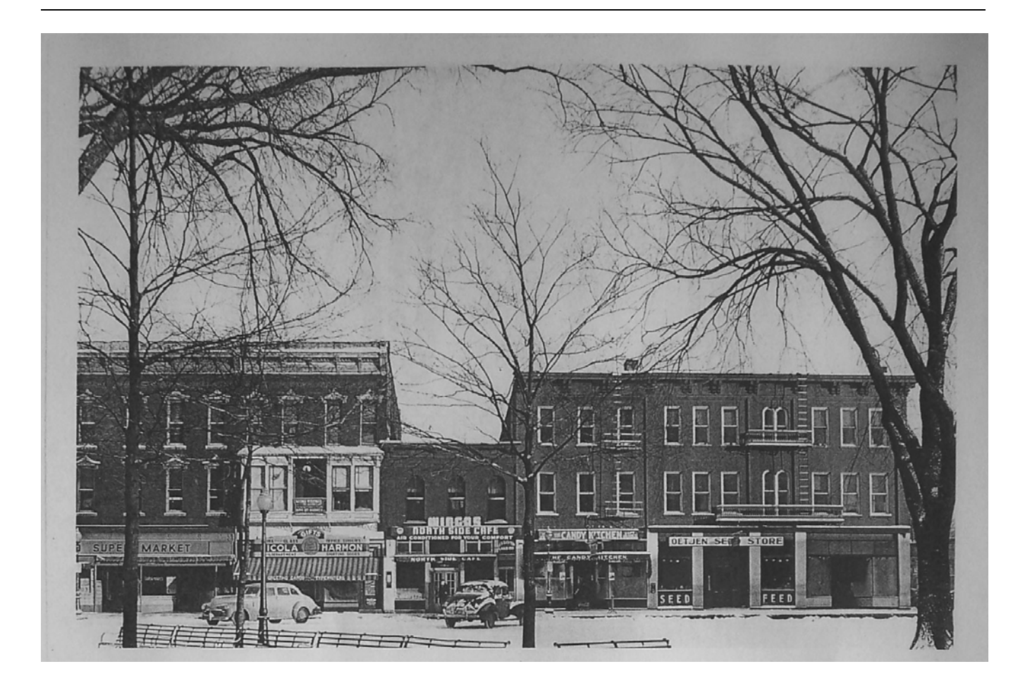
North side of square in late 1930s.