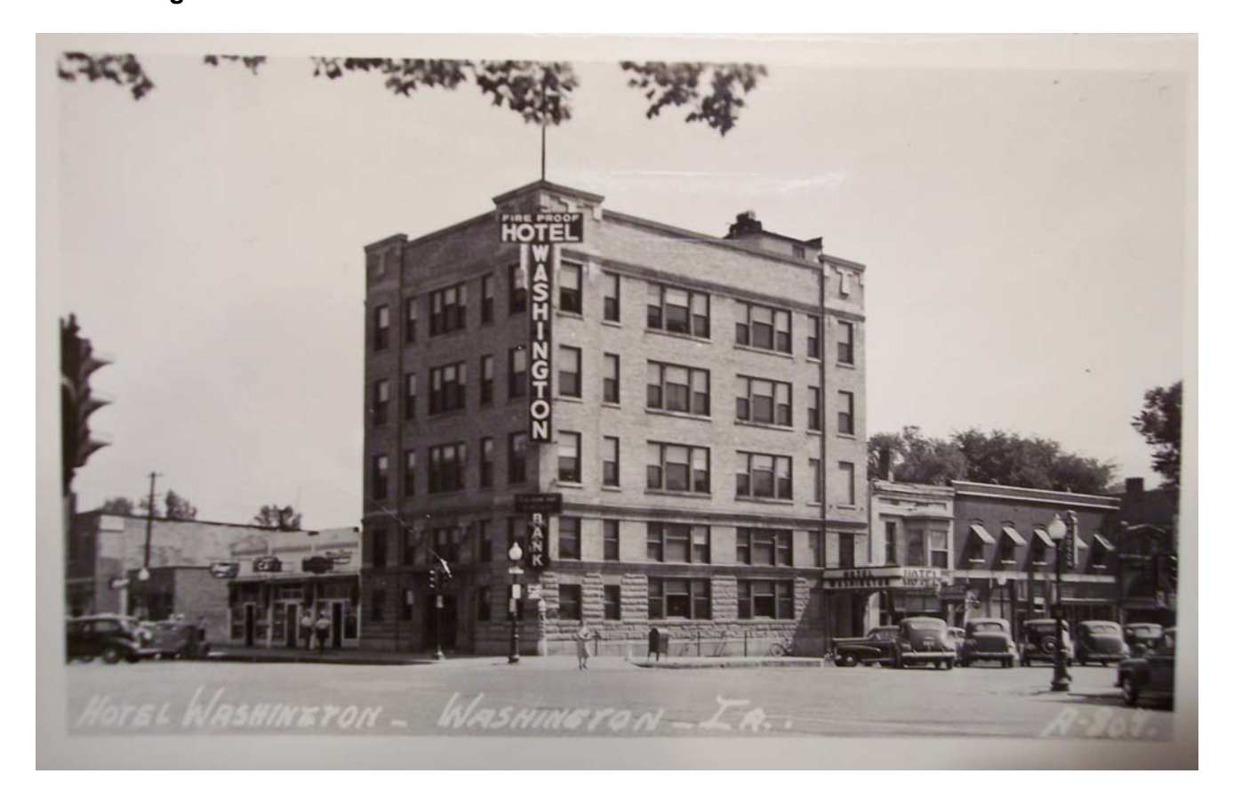
Photograph of building in 1930s.