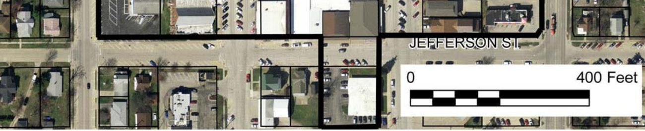
2009 aerial photograph (Washington County) - line indicates survey/research area boundary