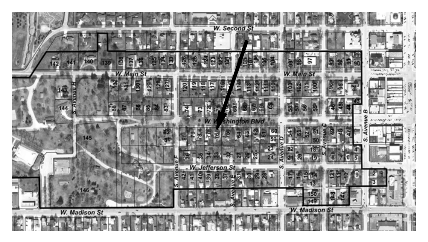
2009 aerial photograph (Washington County) – line indicates survey/research area boundary