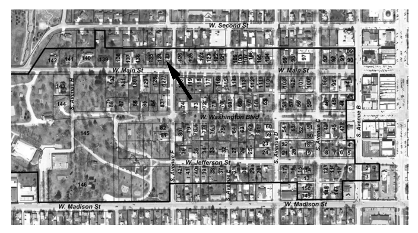
2009 aerial photograph (Washington County) – line indicates survey/research area boundary