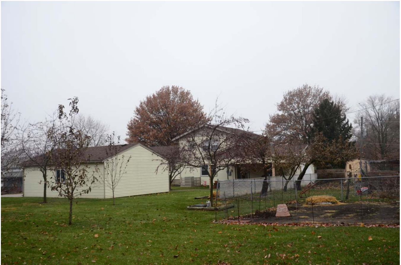
Photograph 92-00750-004 - Garage, looking southeast (December 2014)