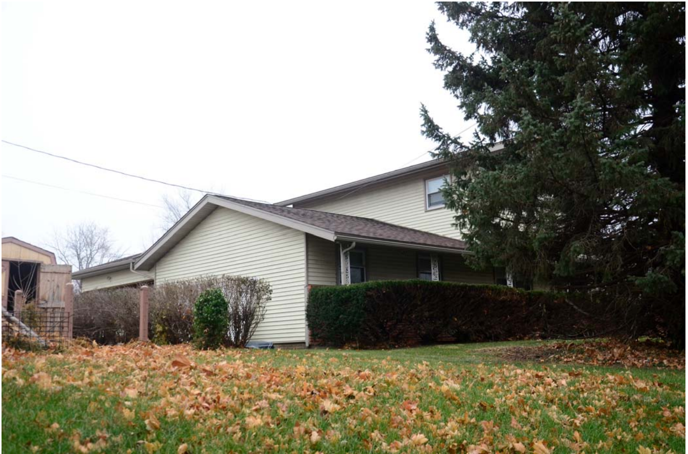
Photograph 92-00750-003 - House, looking southeast (December 2014)