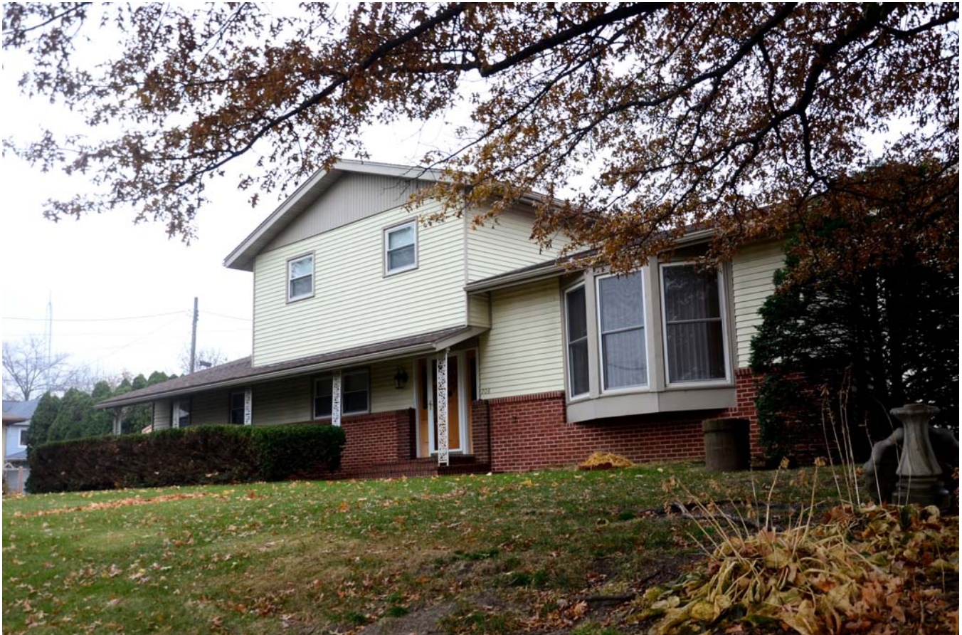
Photograph 92-00750-001 - House, looking northwest (December 2014)