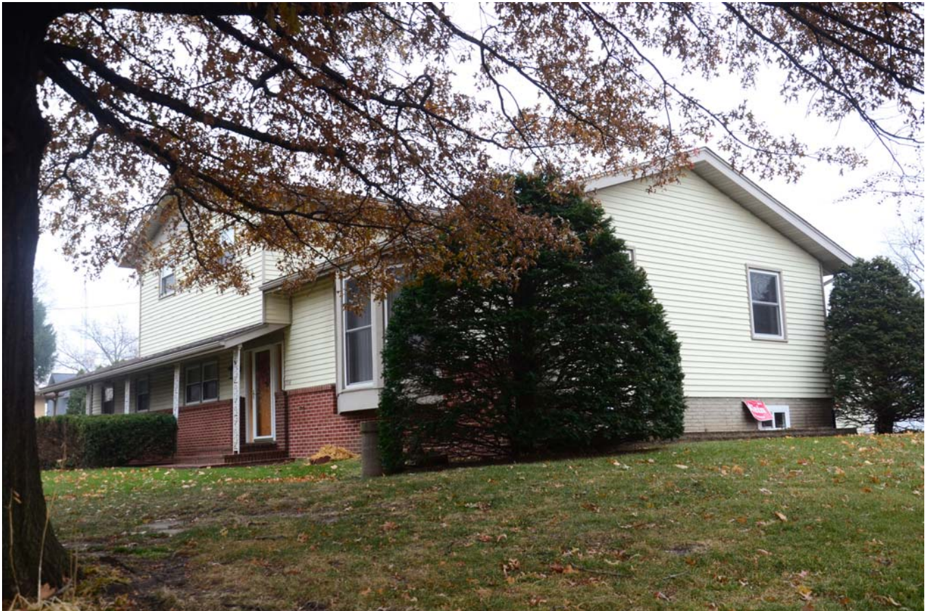
Photograph 92-00750-002 - House, looking northwest (December 2014)