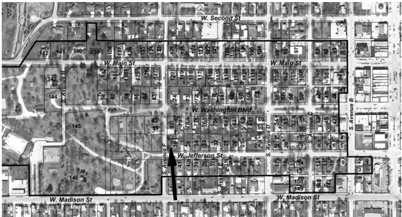
2009 aerial photograph (Washington County) – line indicates survey/research area boundary