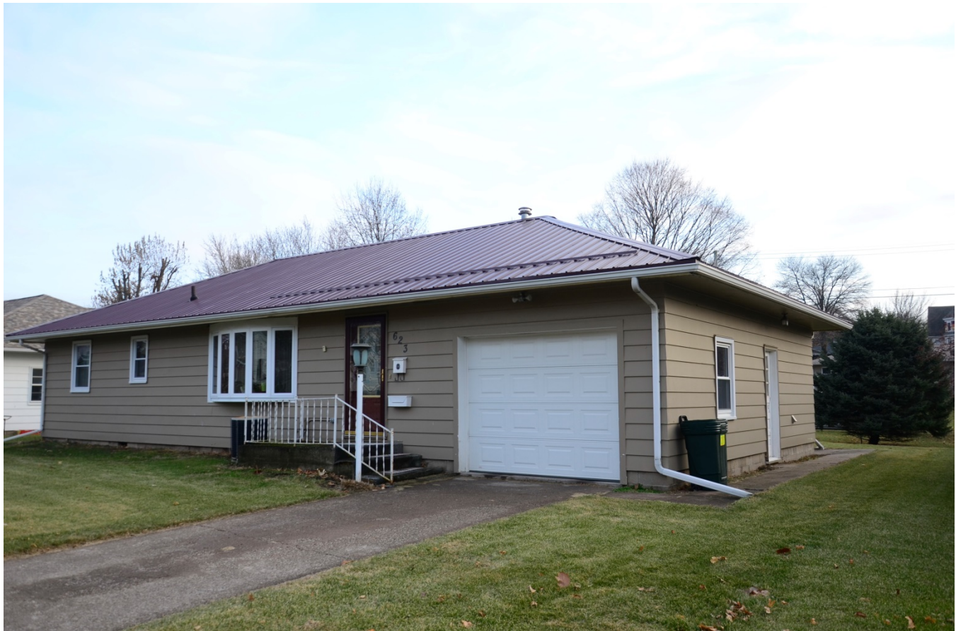
Photograph 92-00778-001 - House, looking southeast (December 2014)