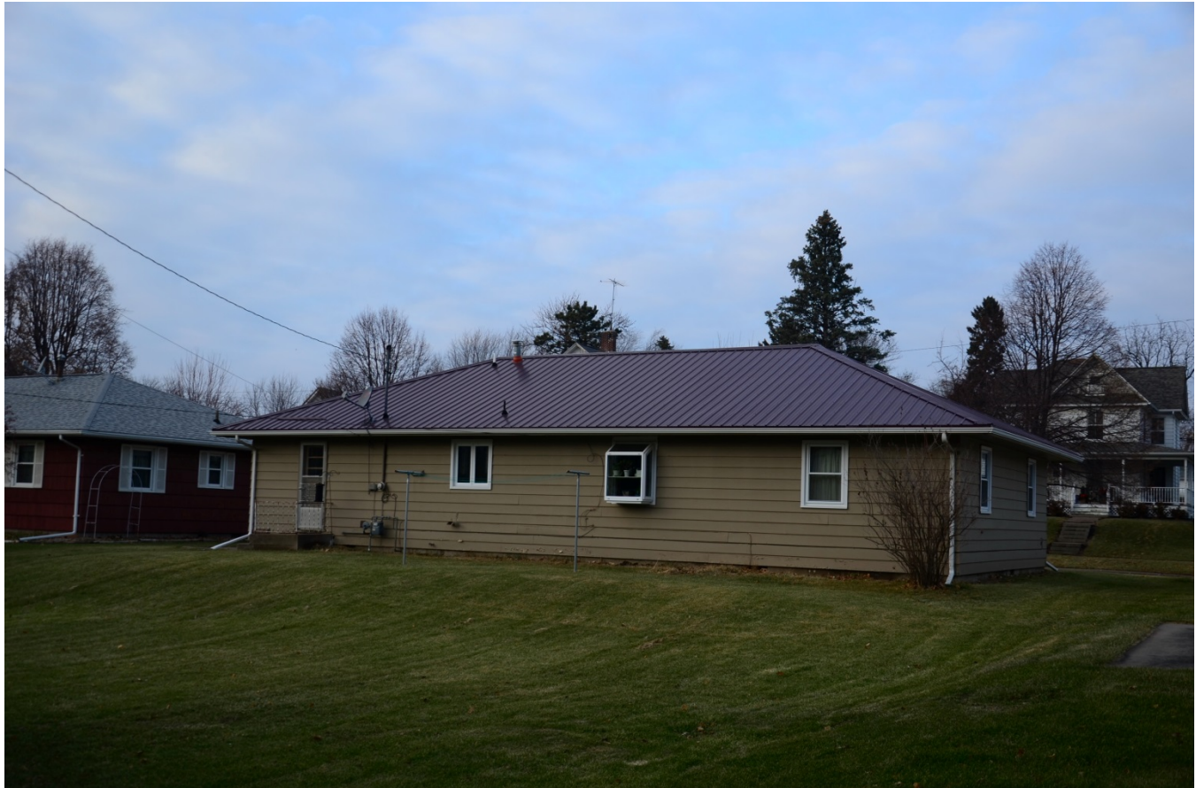
Photograph 92-00778-002 - House, looking northwest (December 2014)