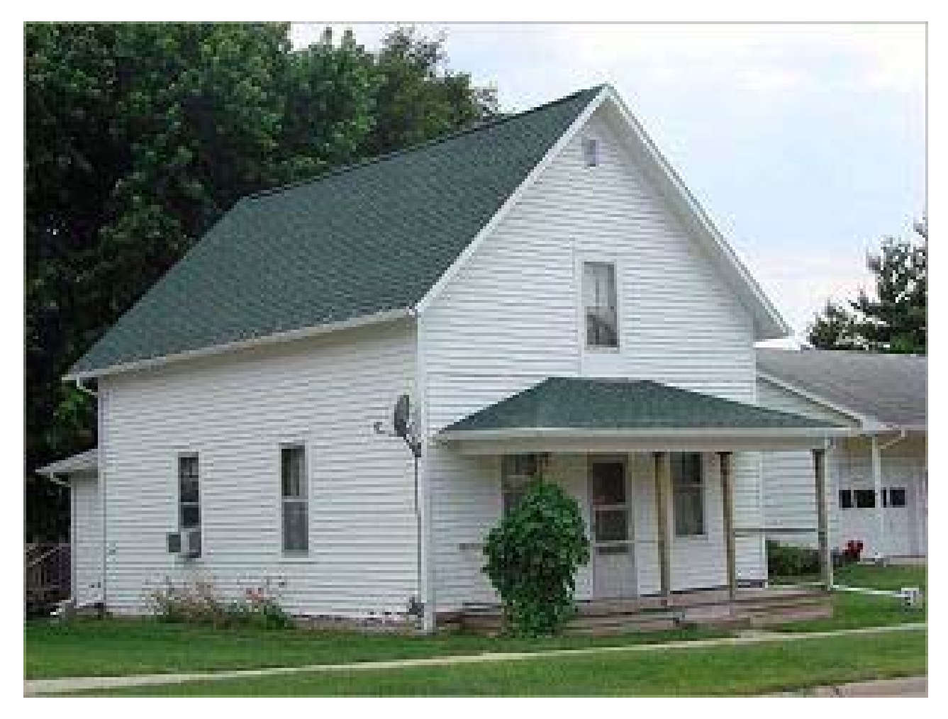
earlier photograph showing 2/2 wood windows