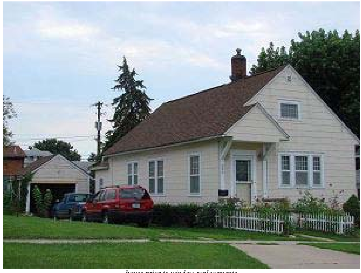
house prior to window replacements