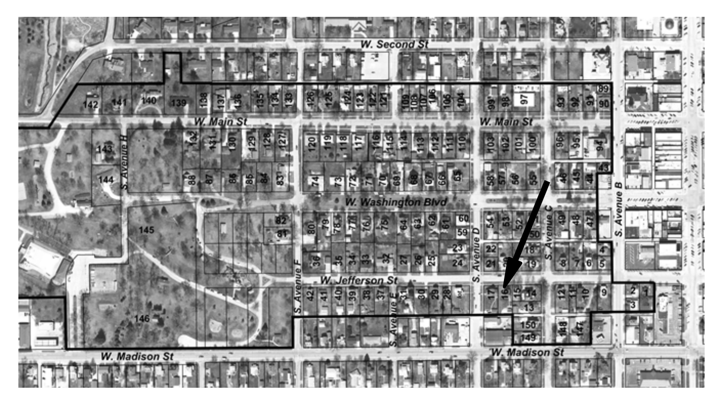
2009 aerial photograph (Washington County) – line indicates survey/research area boundary