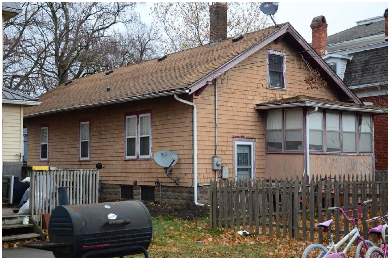
Photograph 92-00422-003 - House, looking northeast (December 2014)