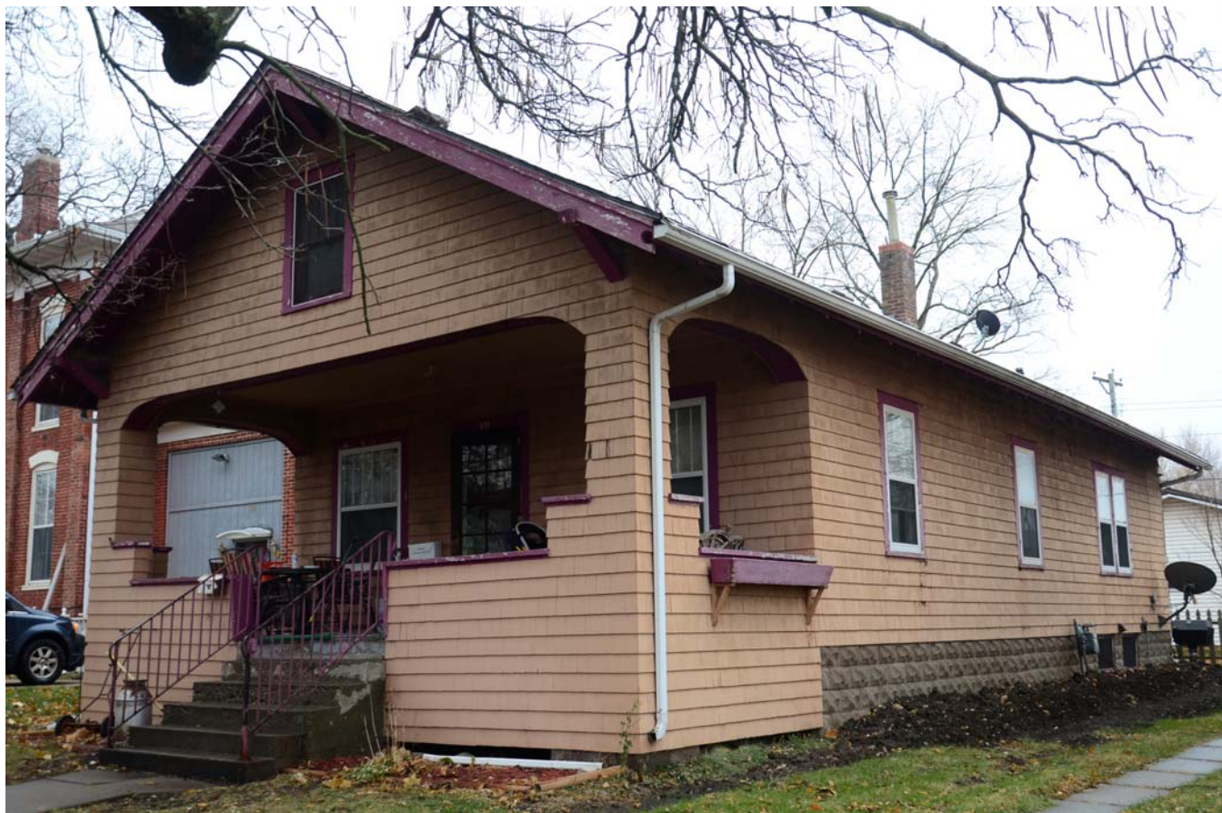
Photograph 92-00422-002 - House, looking southeast (December 2014)