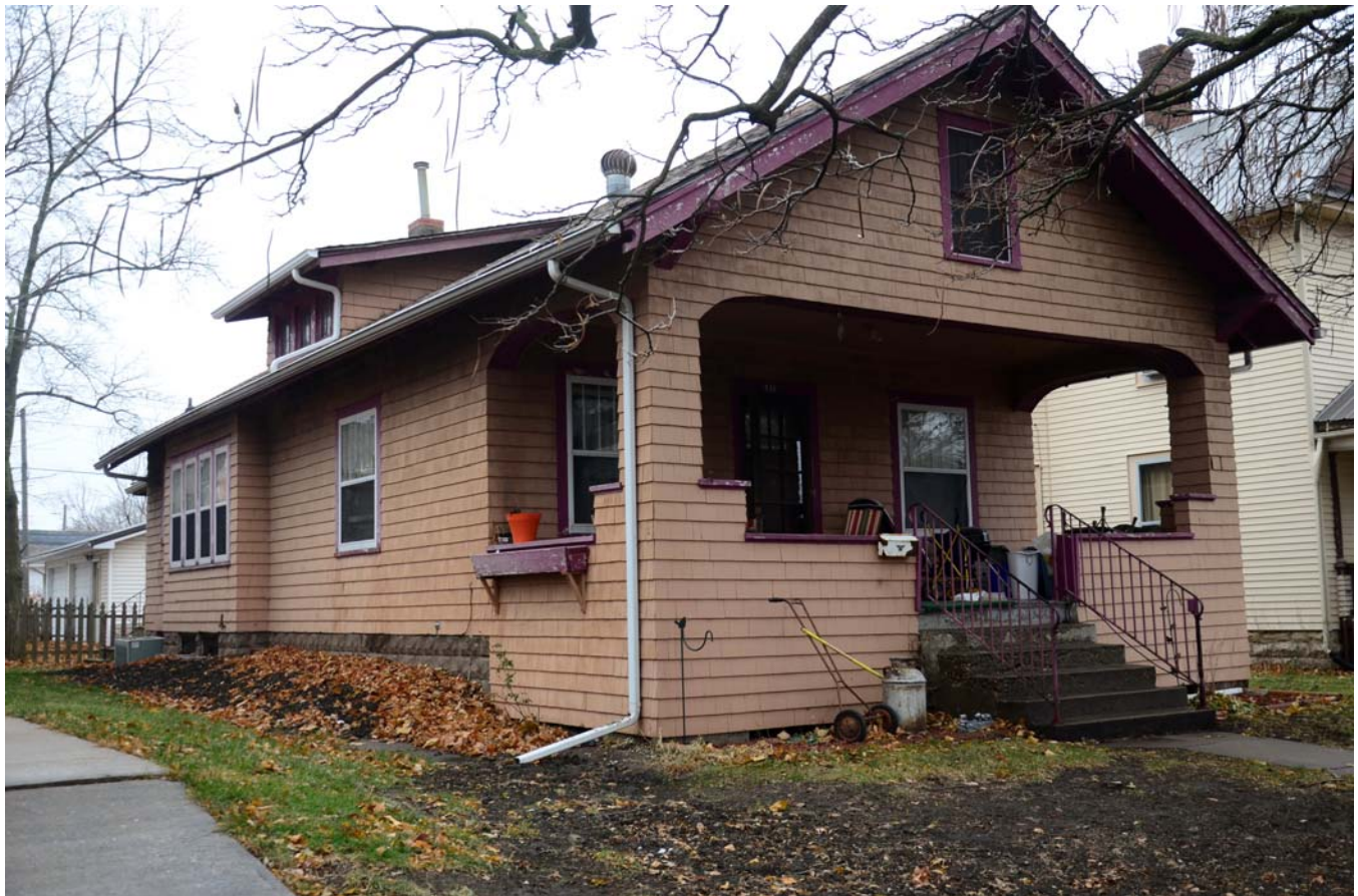
Photograph 92-00422-001 - House, looking southwest (December 2014)