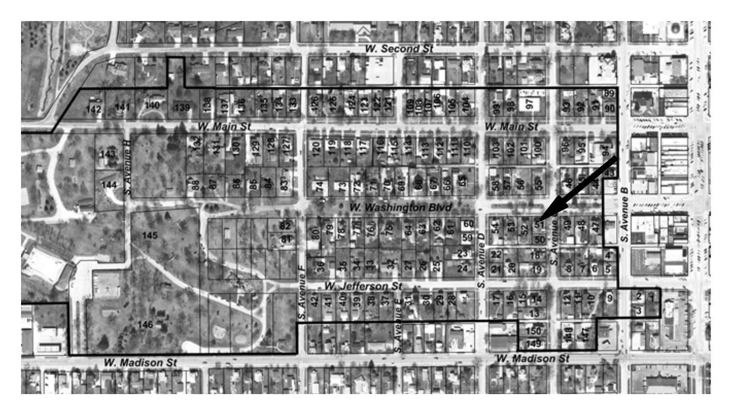
2009 aerial photograph (Washington County) - line indicates survey/research area boundary