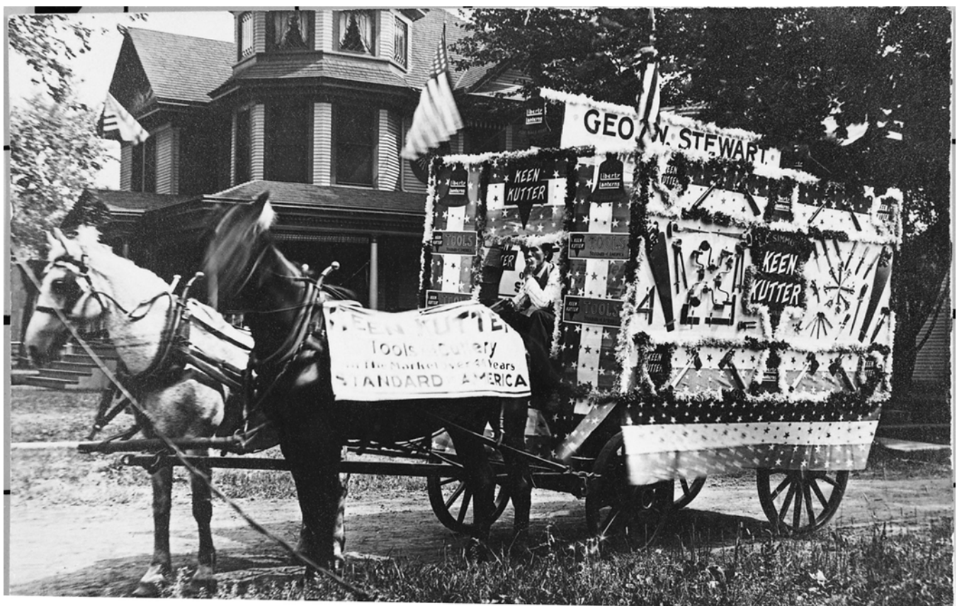
House in background, undated photo