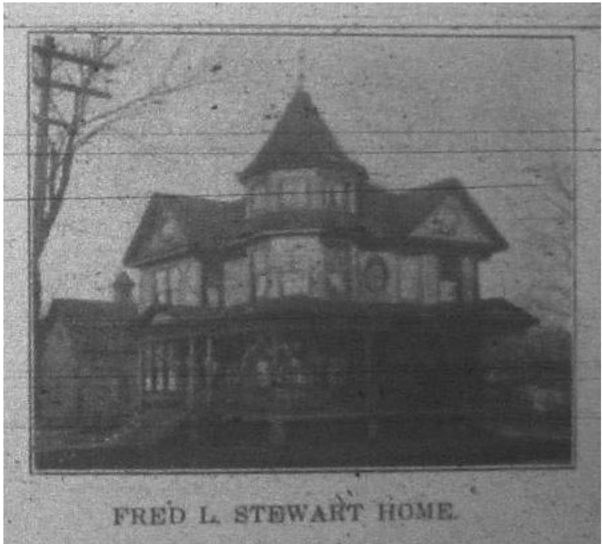
Evening Journal, April 26, 1913, page 4