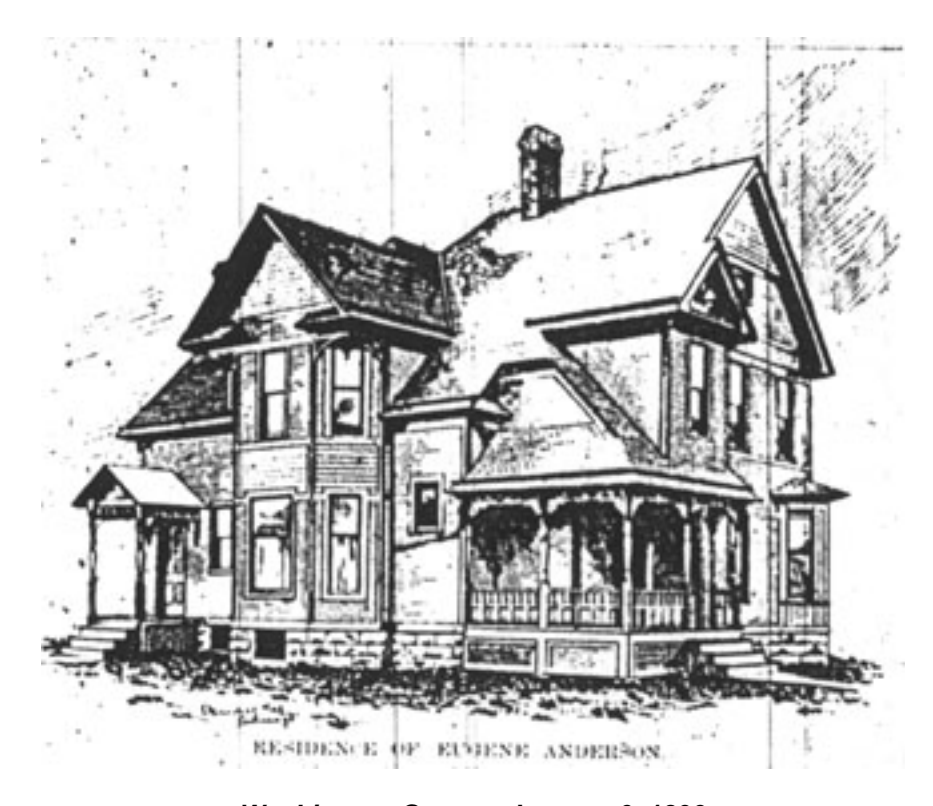
Washington Gazette, January 6, 1893