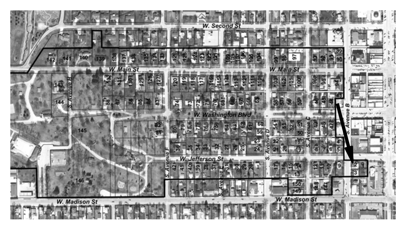
2009 aerial photograph (Washington County) – line indicates survey/research area boundary