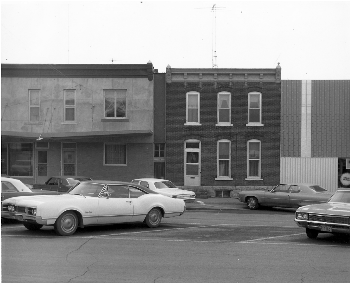
Cox home - 213