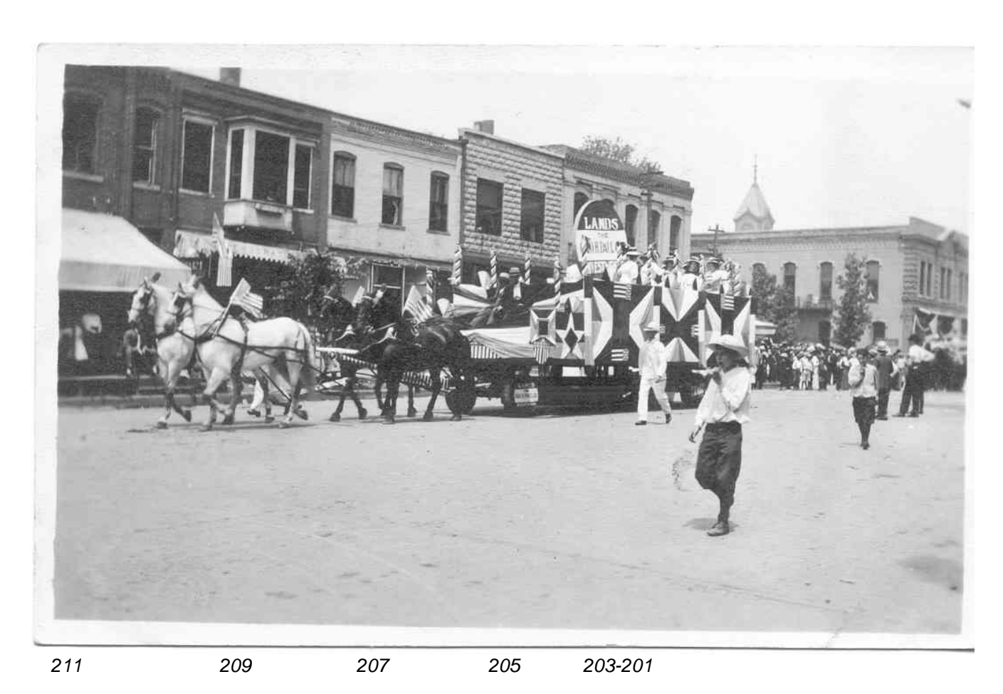
200 block of S. Marion around 1911