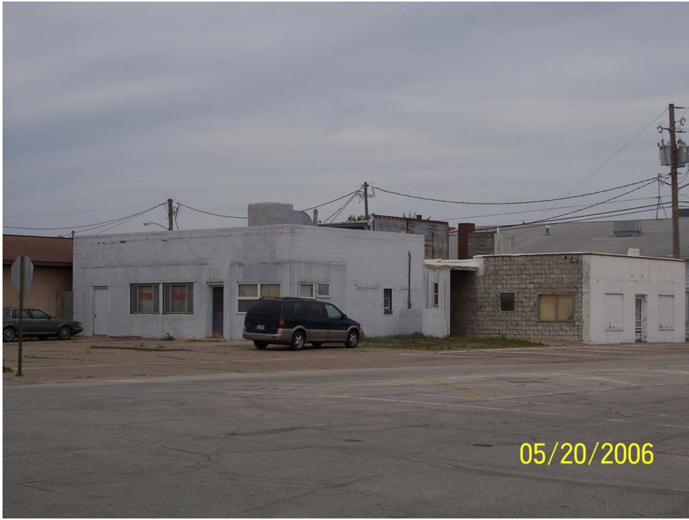
gas station at 201 N lowa