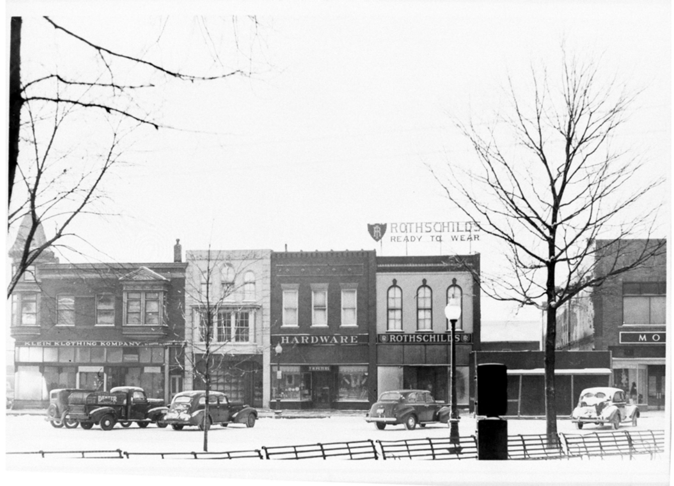
South side of the square in the late 1930s