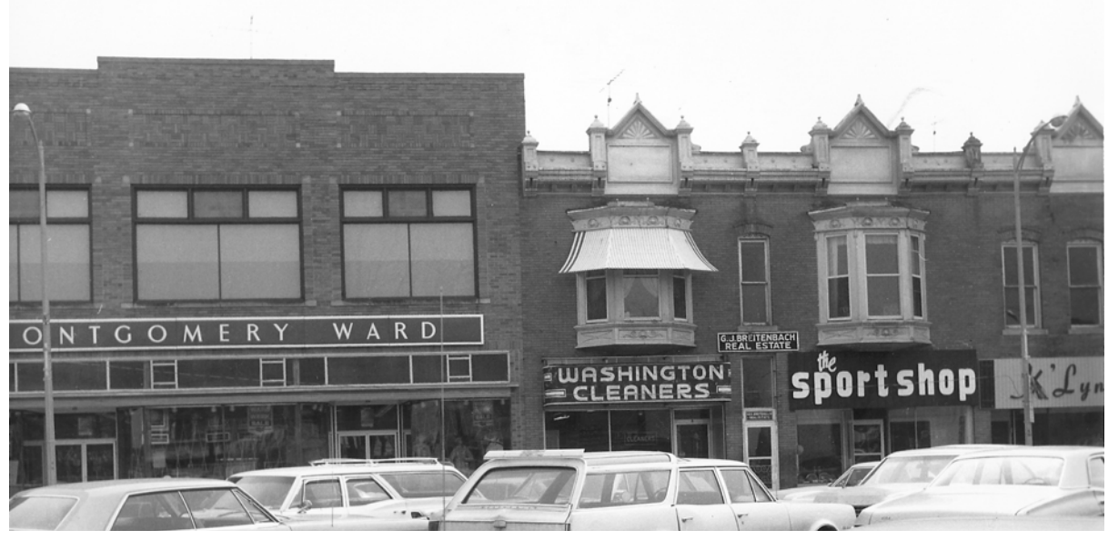
Buildings on site of future library in 1971 (Wagner 1971)