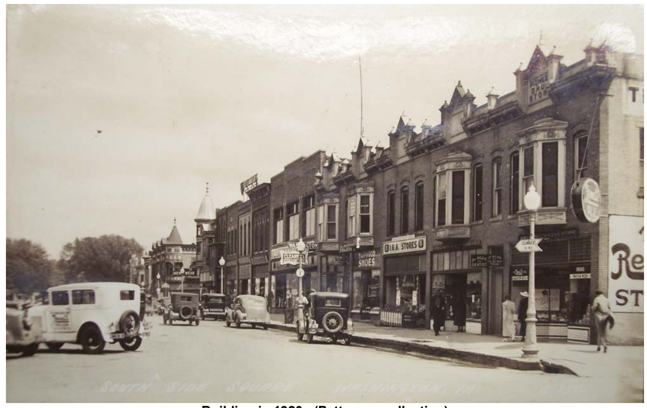
Building in 1920s

Page 9 Commercial building Washington Name of Property County 117 – 119 W. Washington Street Washington Address City