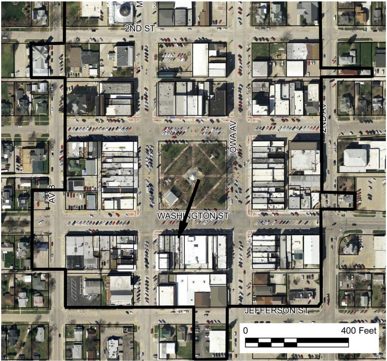
2009 aerial photograph (Washington County) – line indicates survey/research area boundary