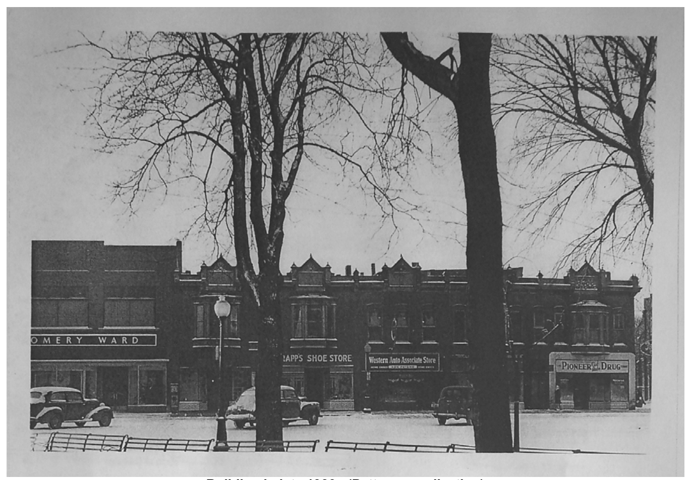
Building in late 1930s

Page 10 Commercial building Washington Name of Property County 117 – 119 W. Washington Street Washington Address City