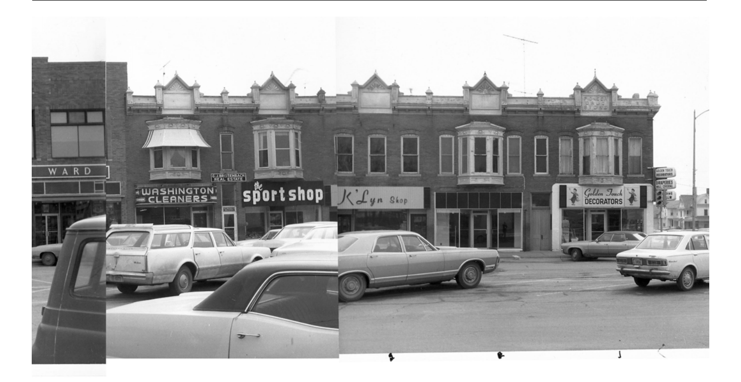
Collage of photos of building in 1971 (Wagner 1971)

Page 11 Commercial building Washington Name of Property County 117 – 119 W. Washington Street Washington Address City