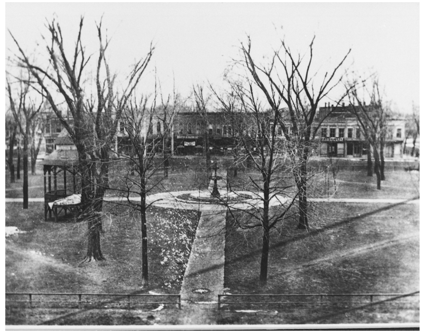
Looking through Central Park at south side of square, after 1891 construction of L. Smouse block at left (101-103) but before remodel of 117-119, 121, and 123-125 at right (west) end