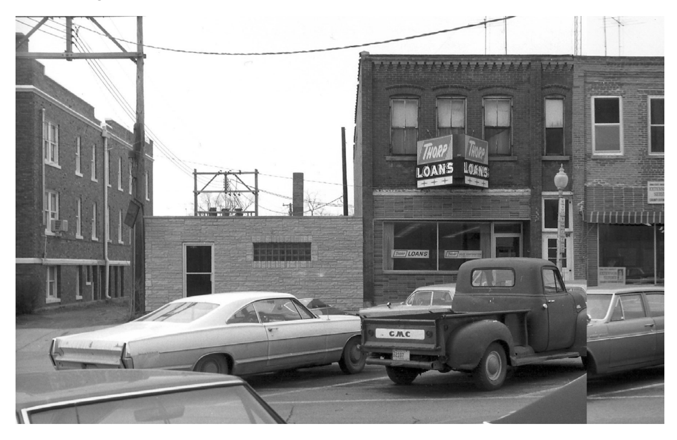
Building in 1971 (Wagner 1971)