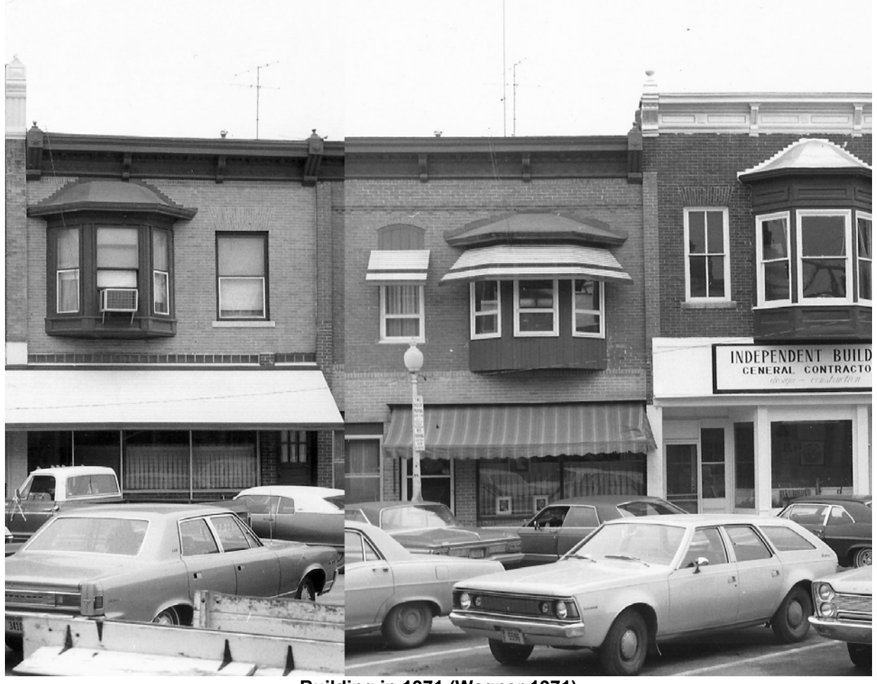
Building in 1971 (Wagner 1971)