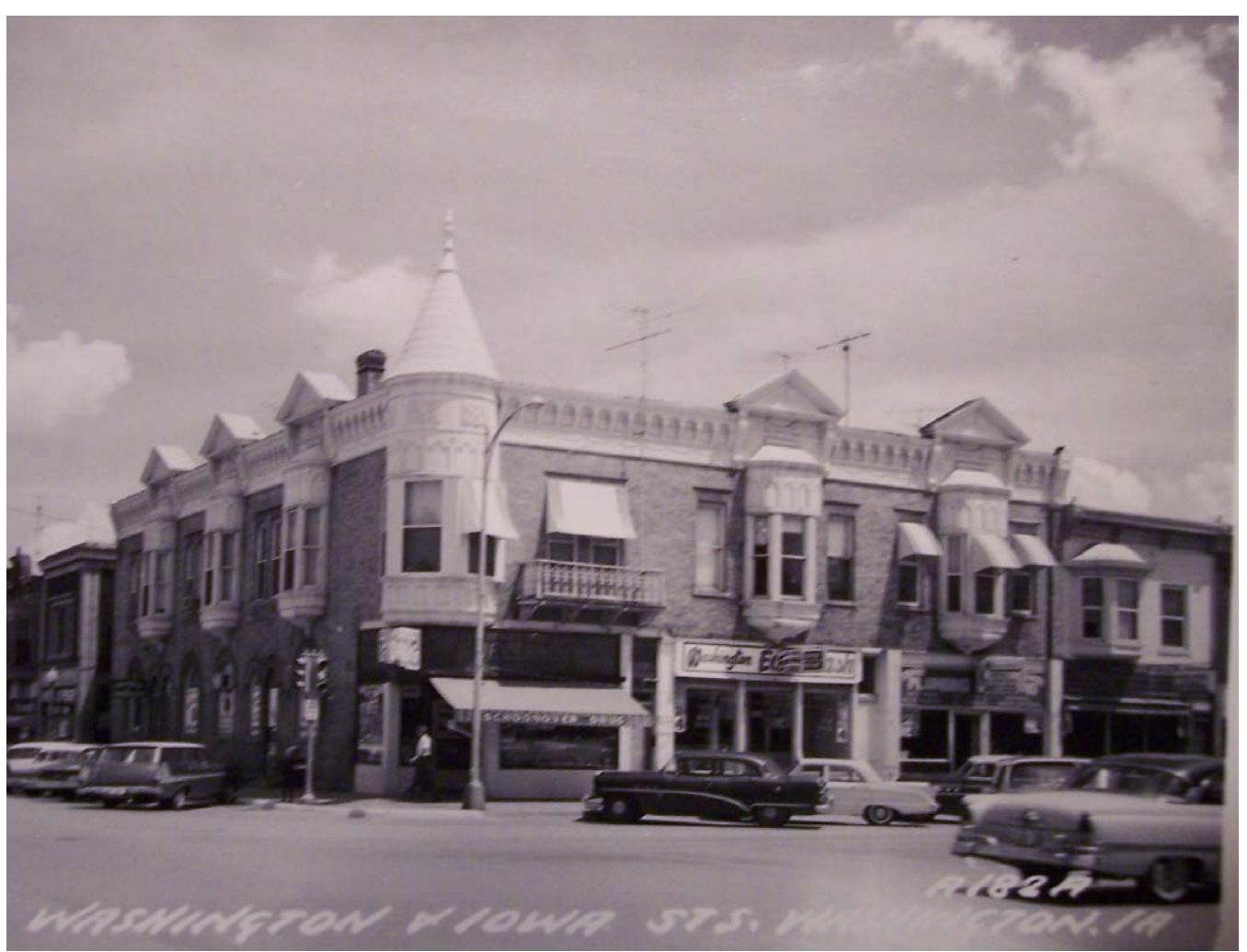
Postcard showing building in c.1950s