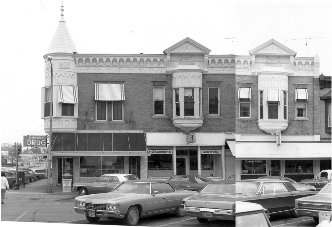
West side of building in 1971 (Wagner 1971)