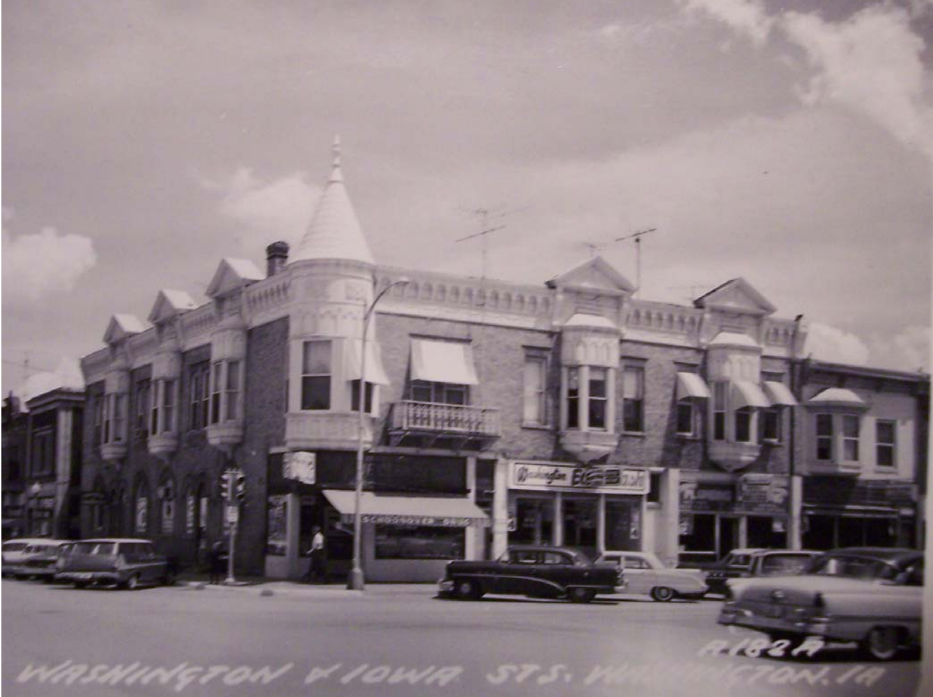
Postcard showing building in c.1950s