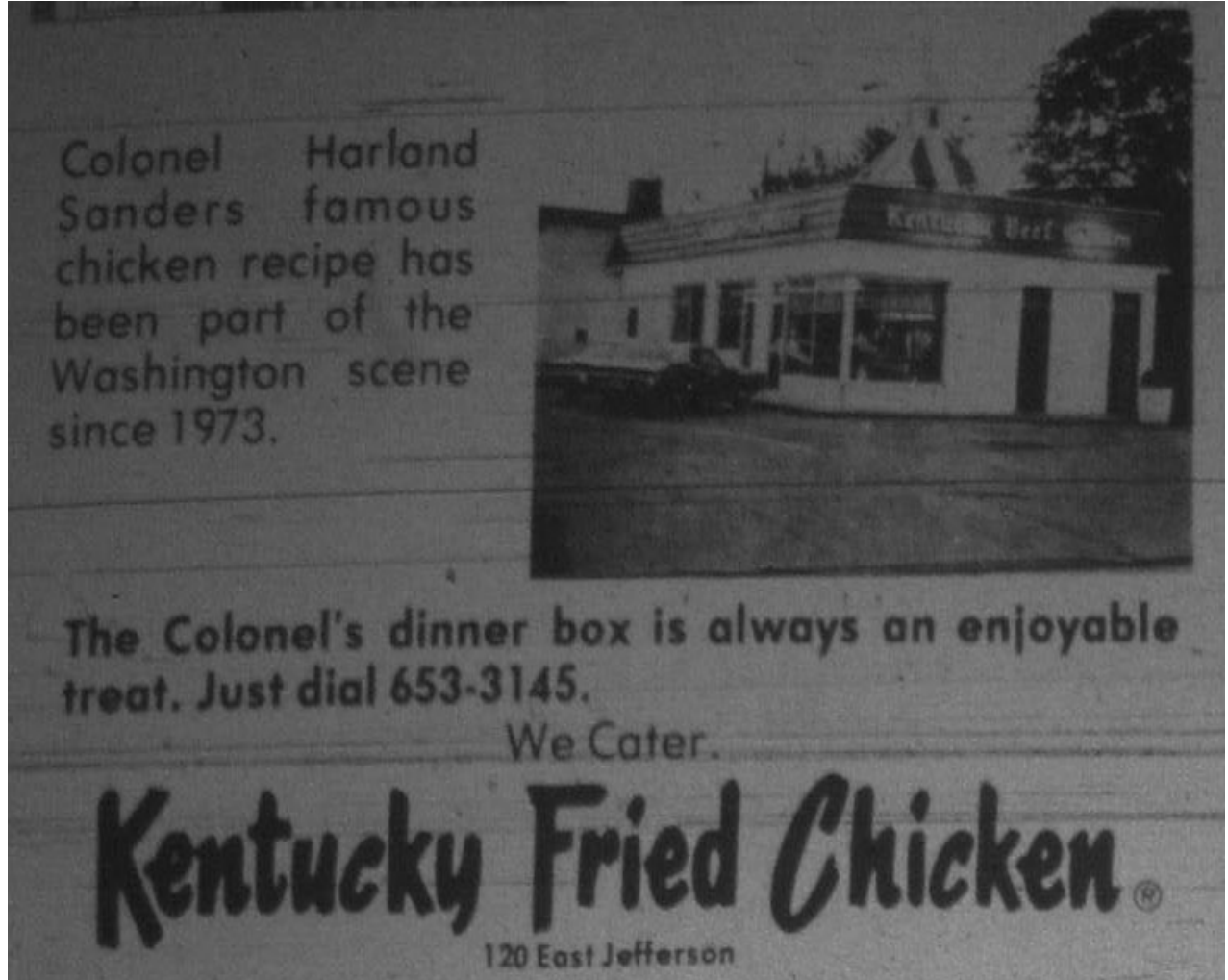
Evening Journal, July 1, 1976, p125