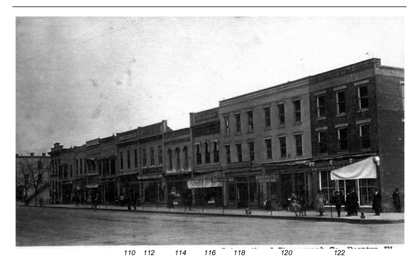
East side of the square around 1911

Page 8 Blair Building Washington Name of Property County 122 S. Iowa Avenue Washington Address City