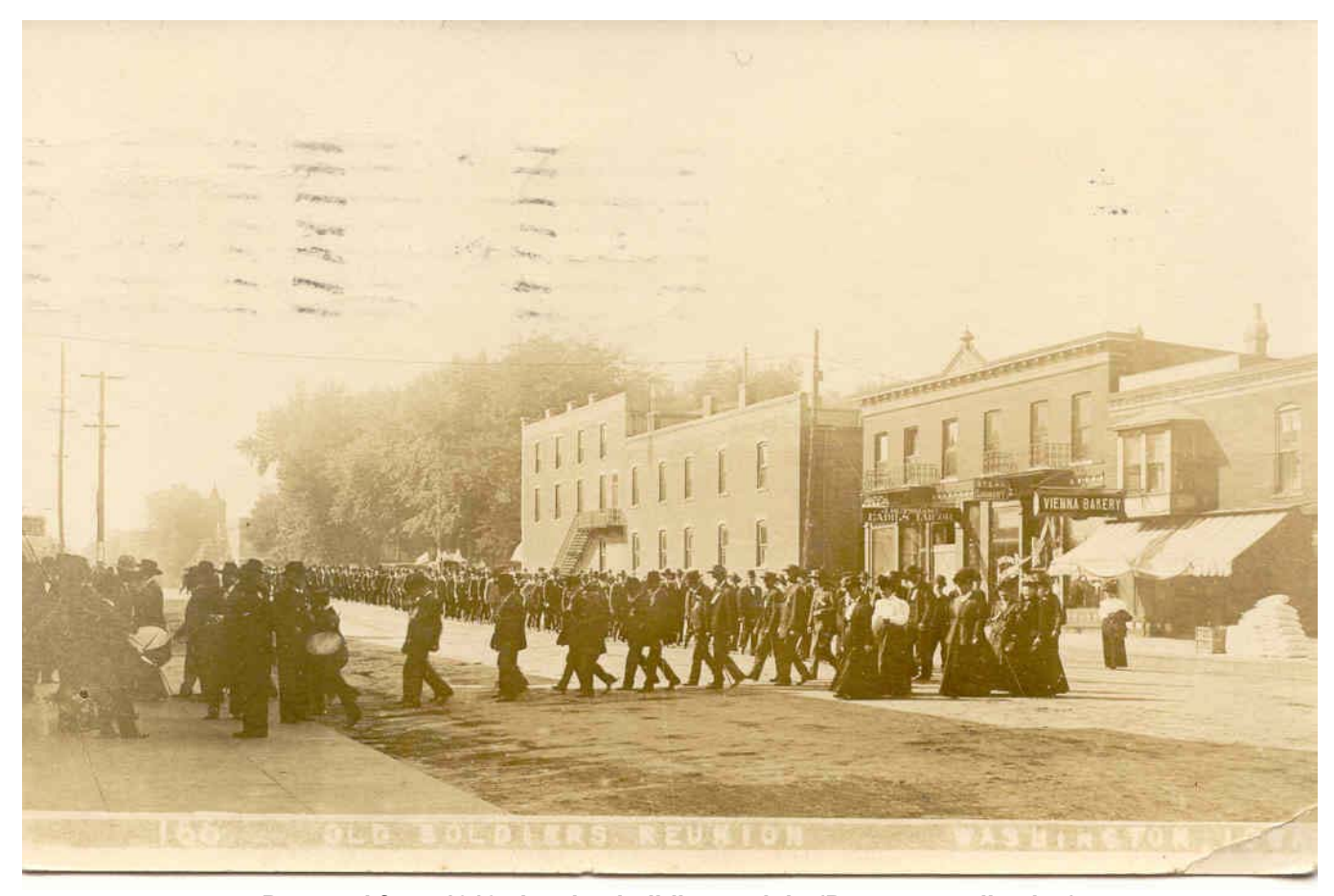
Postcard from 1910 showing building at right