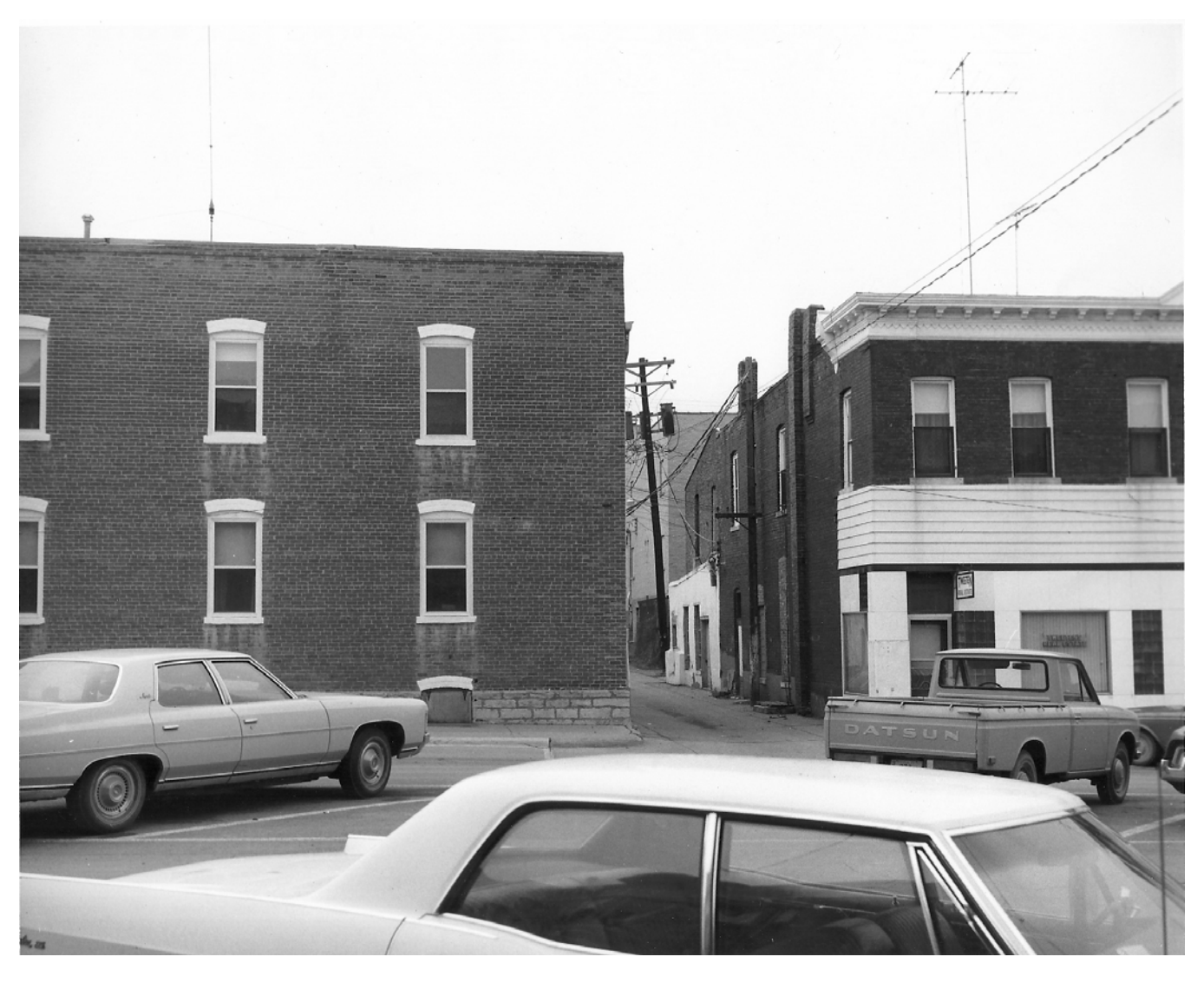
Part of building in 1971 (Wagner 1971)

Page 8 Winfield Smouse Block Washington Name of Property County 112-114 E. Washington Street Washington Address City