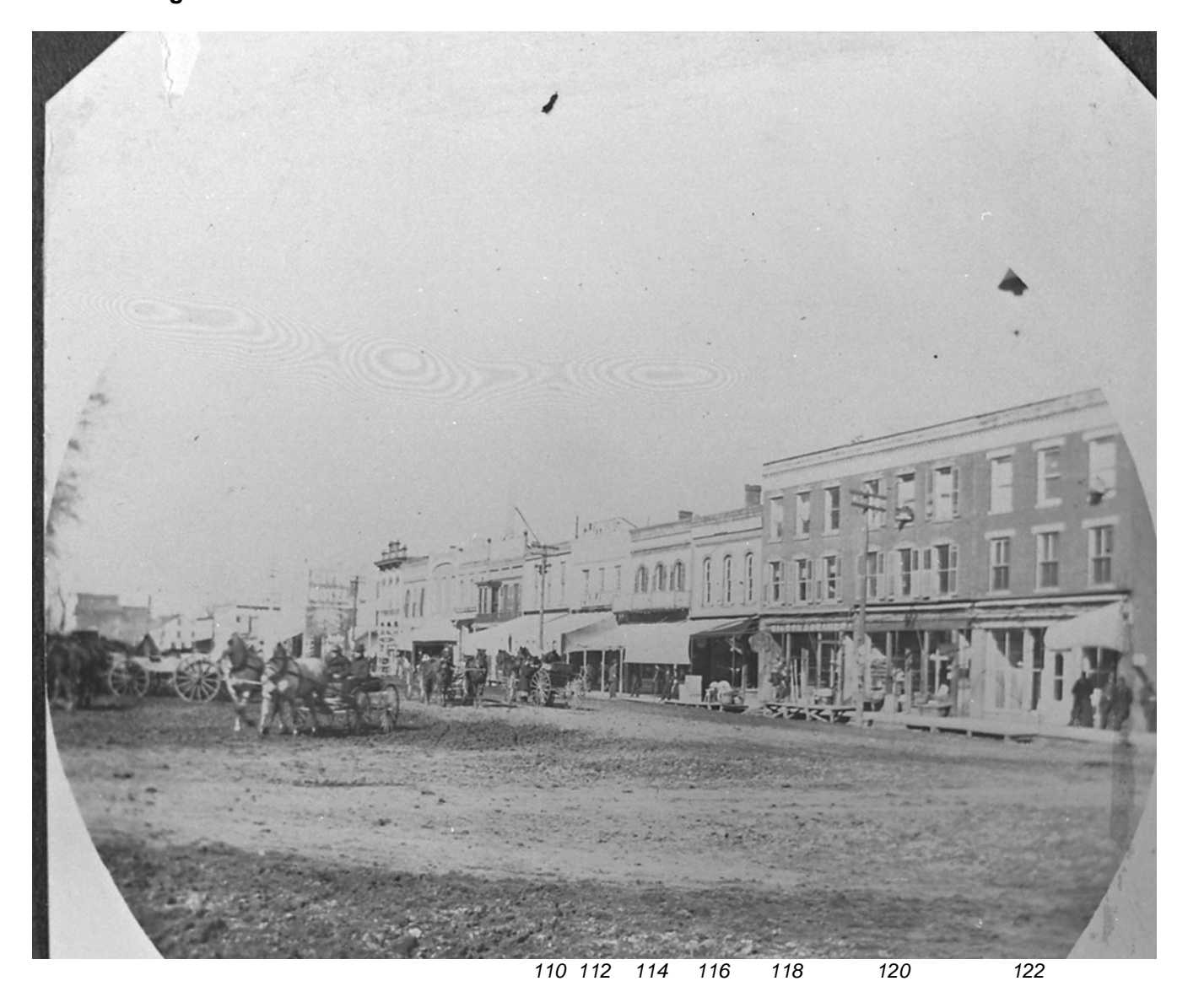
East side of the square in the 1890s (Patterson collection)