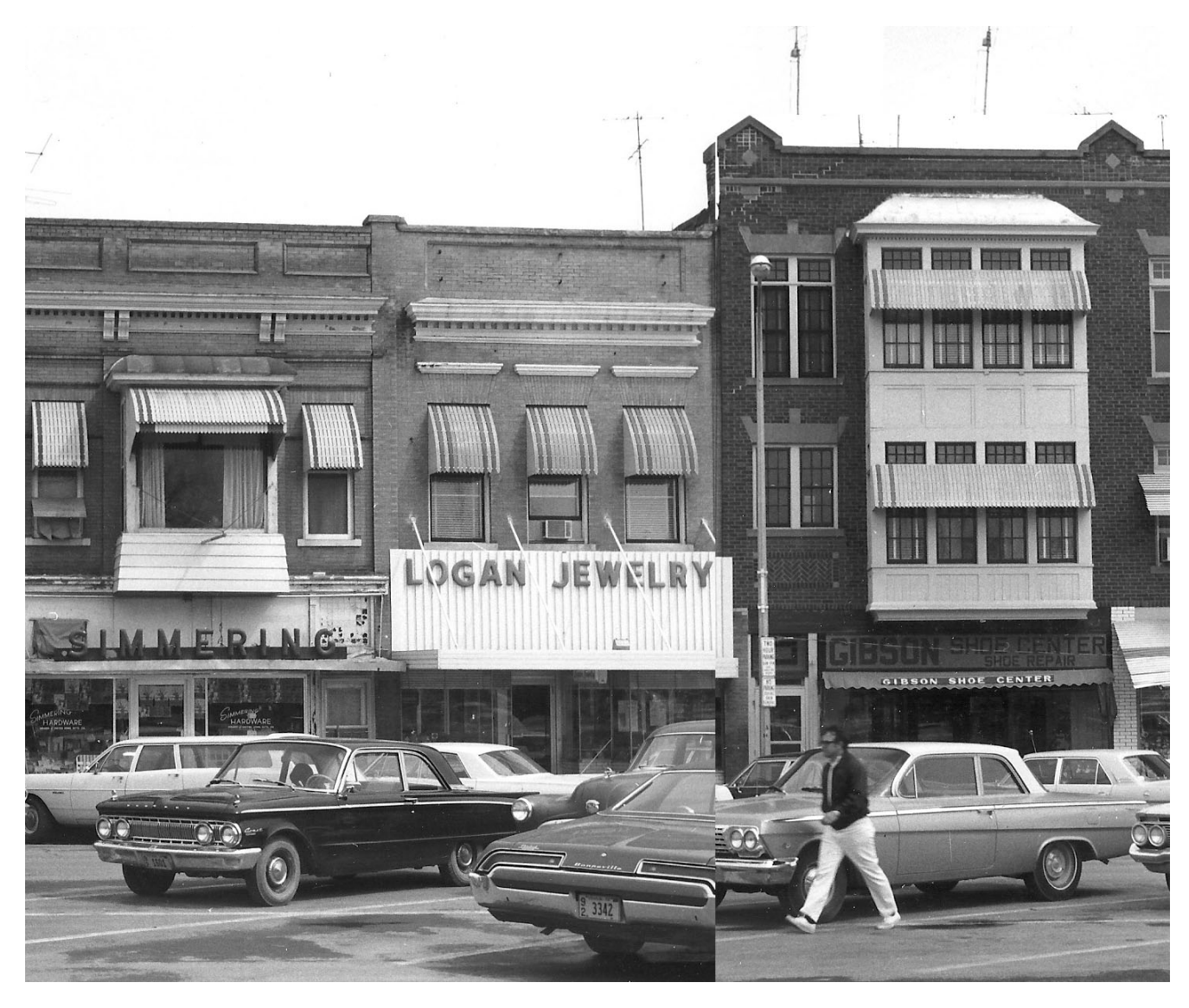
Building in 1971 (Wagner 1971)