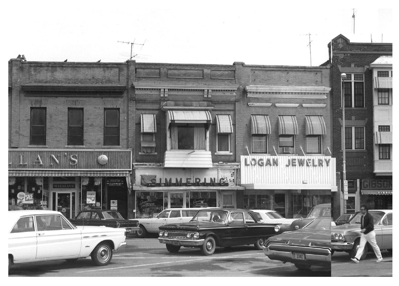
Building in 1971 (Wagner 1971)

Page 9 Keeley Building Washington Name of Property County 114 S. Iowa Avenue Washington Address City