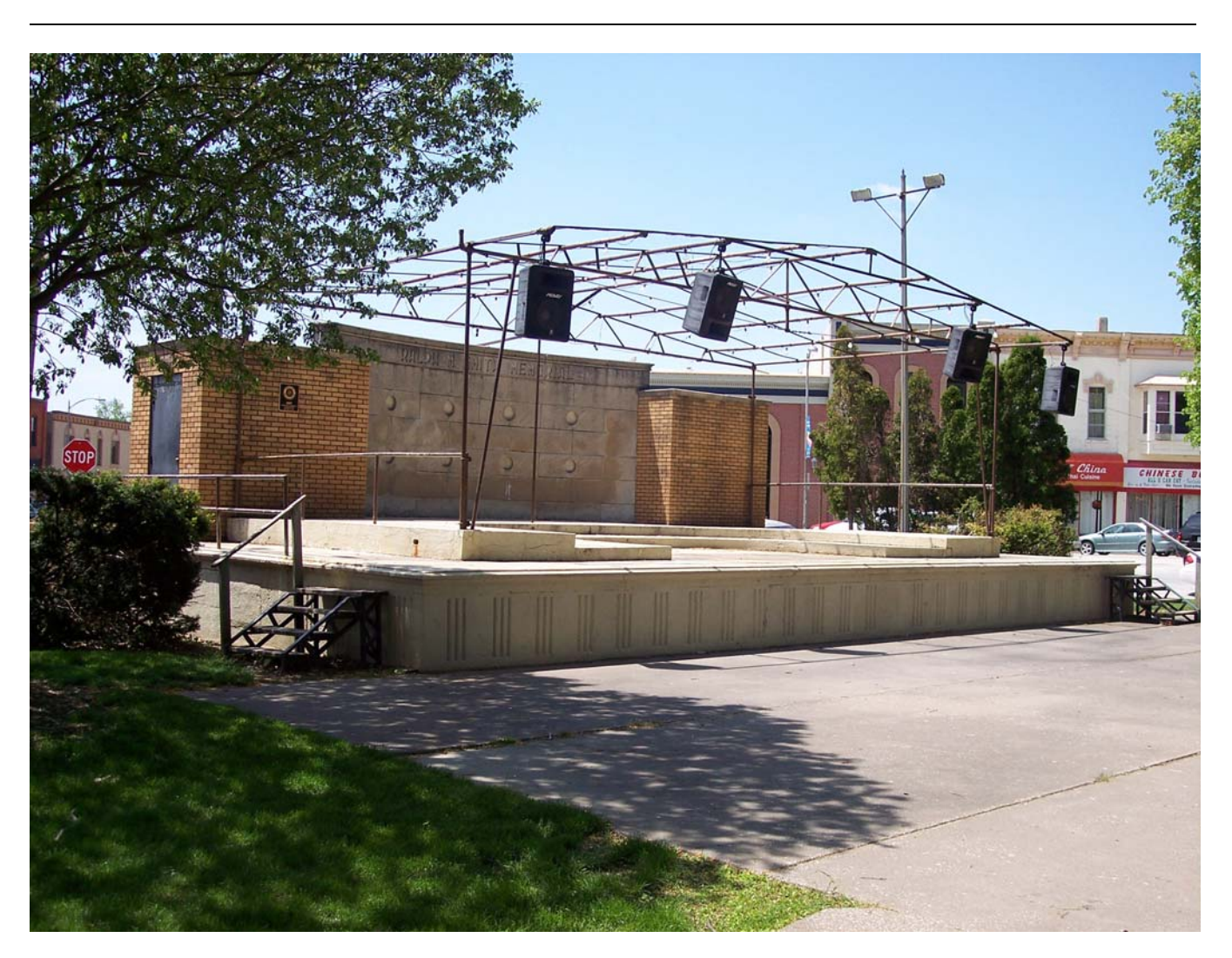
Bandstand before work (Patterson, May 15, 2008)