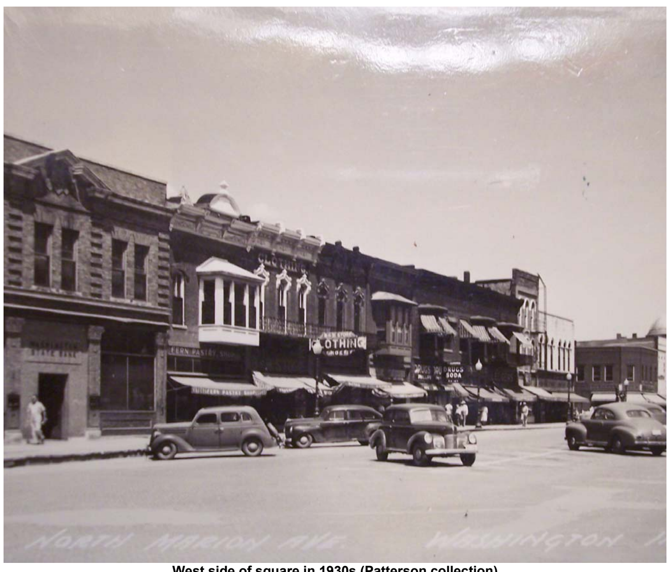
West side of square in 1930s