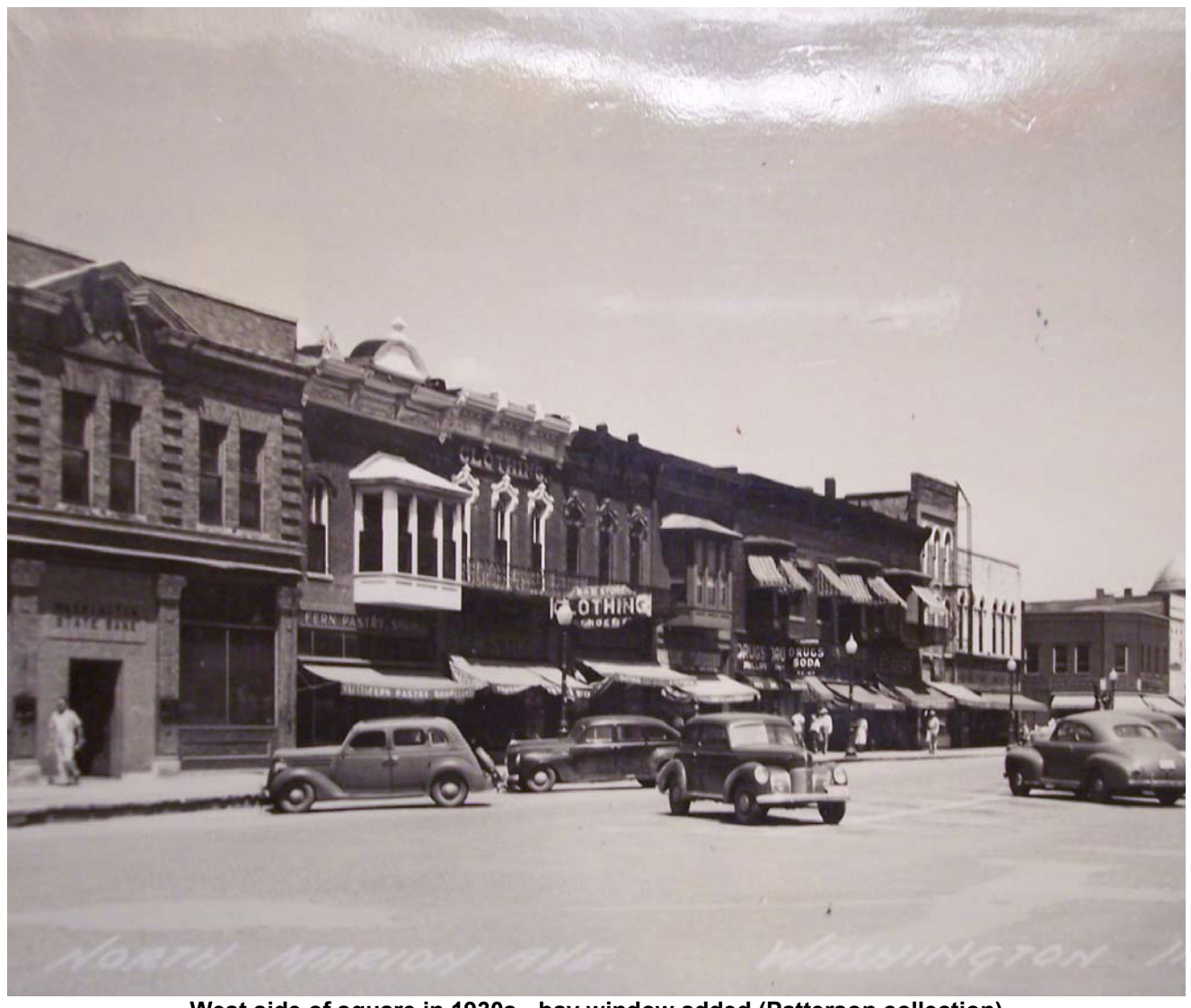
West side of square in 1930s - bay window added

Page 7 Dewey Jewelry Washington Name of Property County 113 S. Marion Avenue Washington Address City