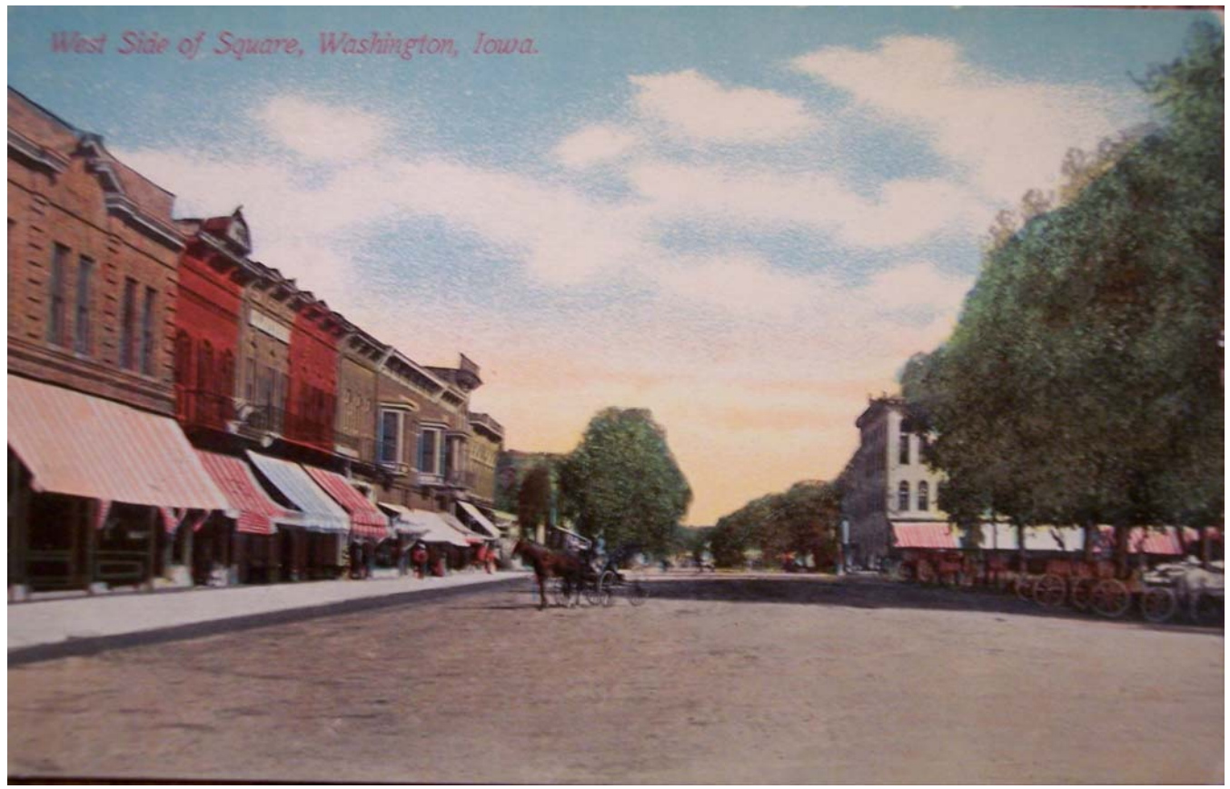
West side of square around 1910 (after 1908 remodel of buildings to north of 113)