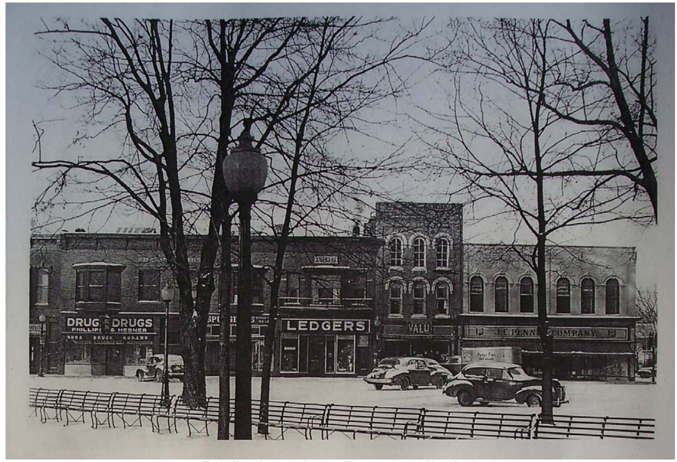
Building in late 1930s