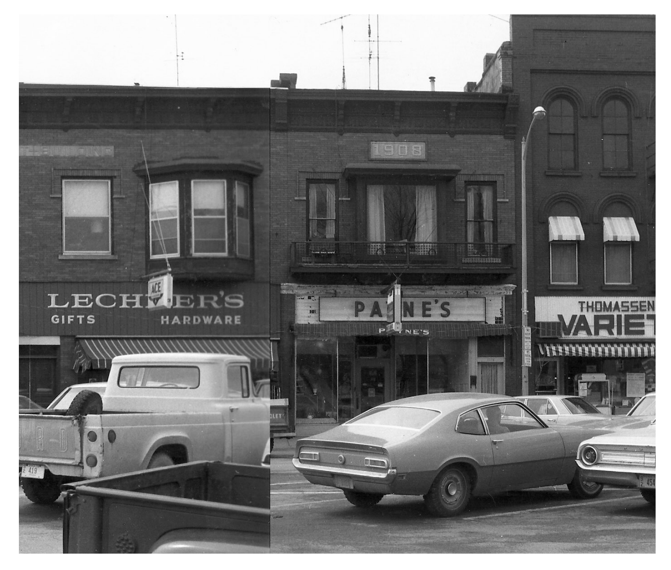
Building in 1971 (Wagner 1971).

Page 9 Mount Building Washington Name of Property County 107 S. Marion Avenue Washington Address City