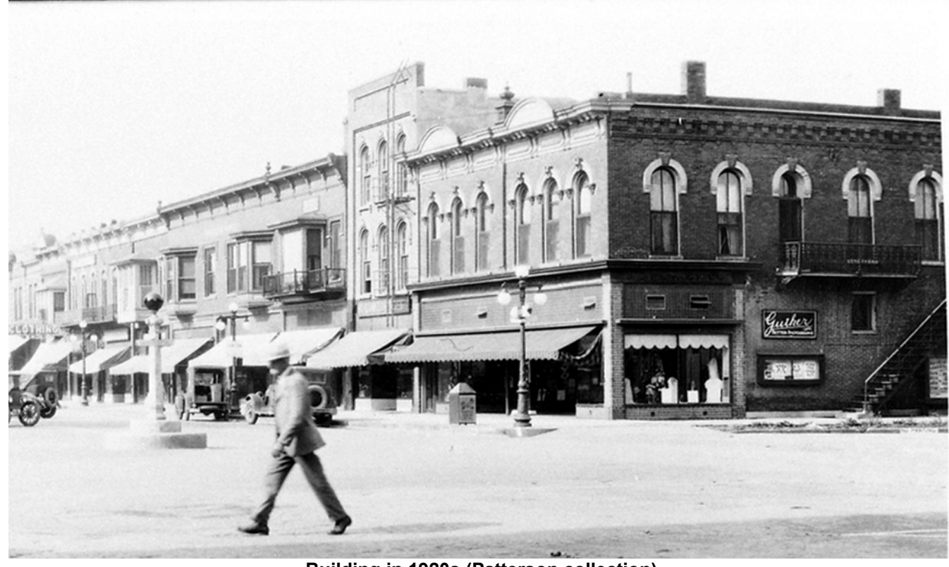
Building in 1920s