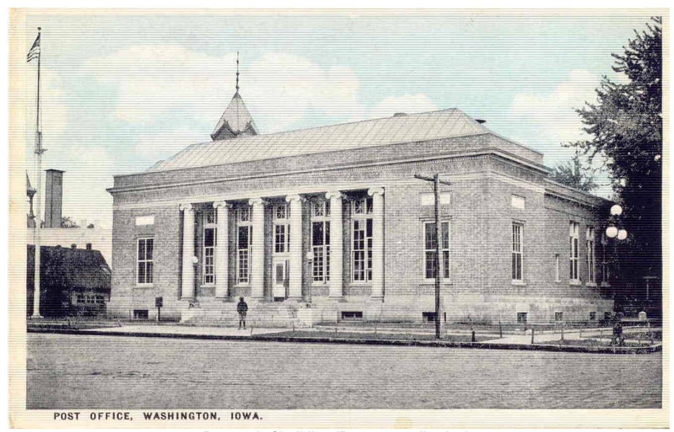
Postcard of building.