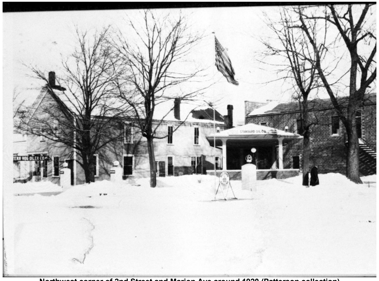
Northwest corner of 2nd Street and Marion Ave around 1920