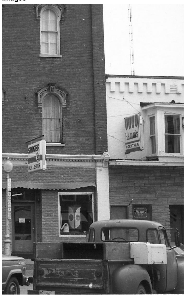
Edge of building in 1971 photograph (Wagner 1971)