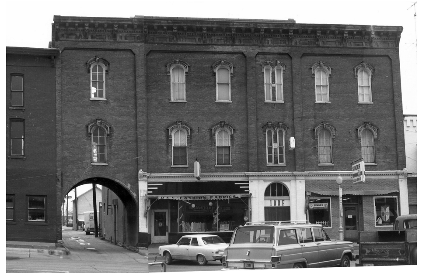
Collage of photographs of the building in 1971 (Wagner 1971)