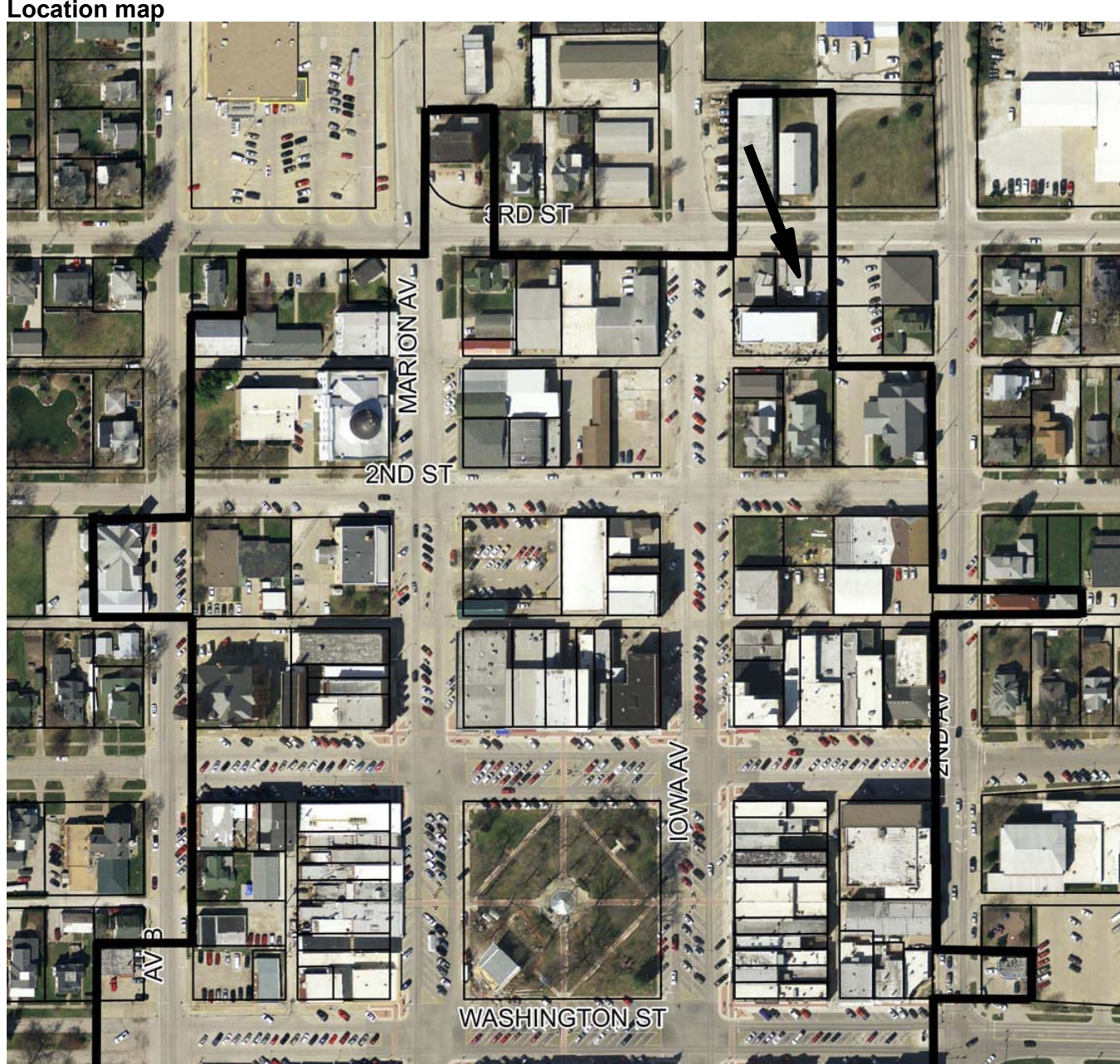
2009 aerial photograph (Washington County) – line indicates survey/research area boundary