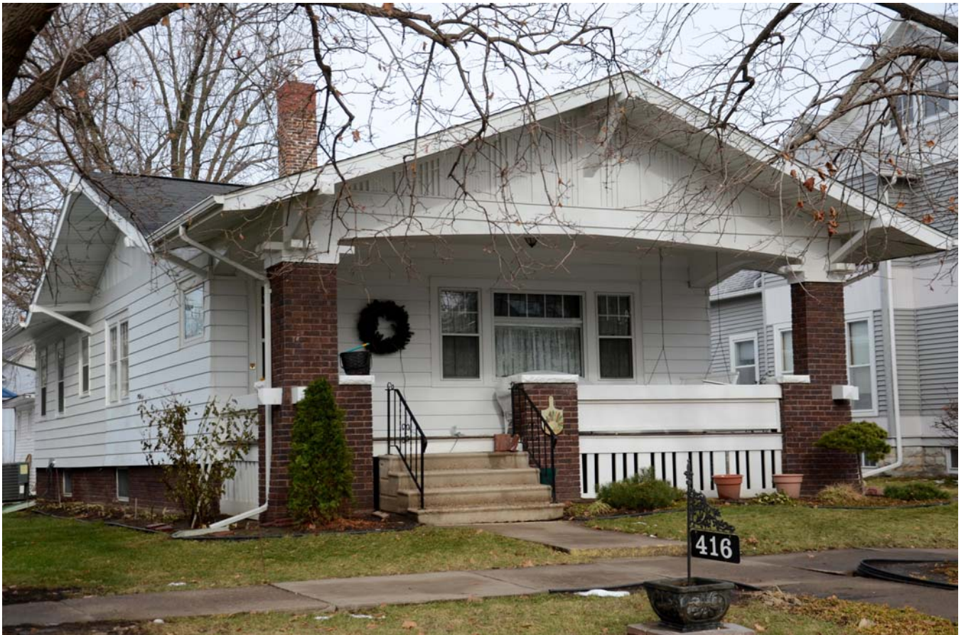
Photograph 92-00387-001 - House, looking northeast (December 2014)