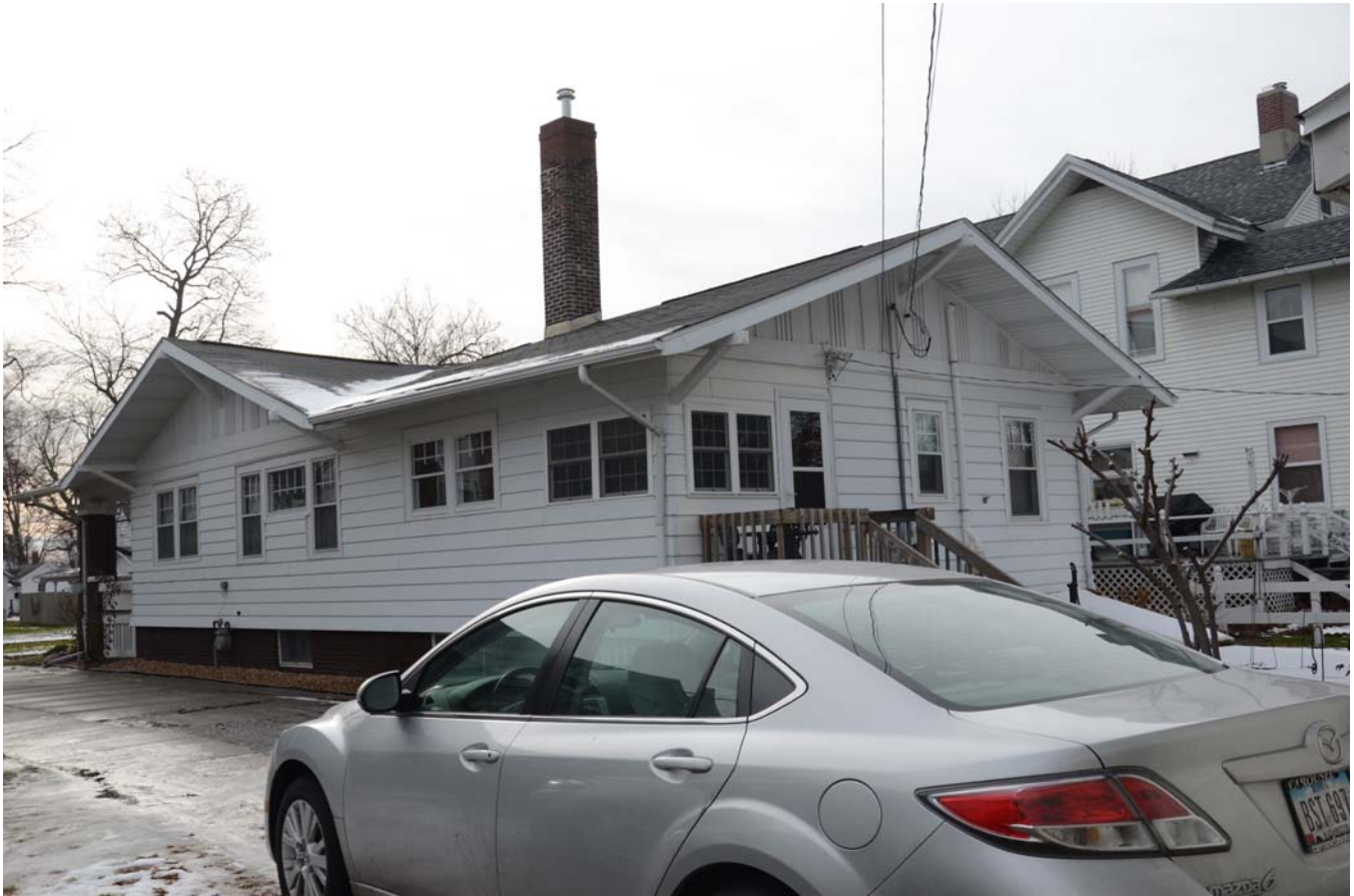
Photograph 92-00387-003 - House, looking southeast (December 2014)