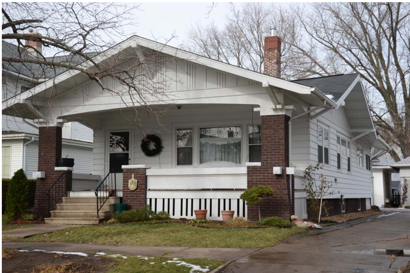
Photograph 92-00387-002 - House, looking northwest (December 2014)