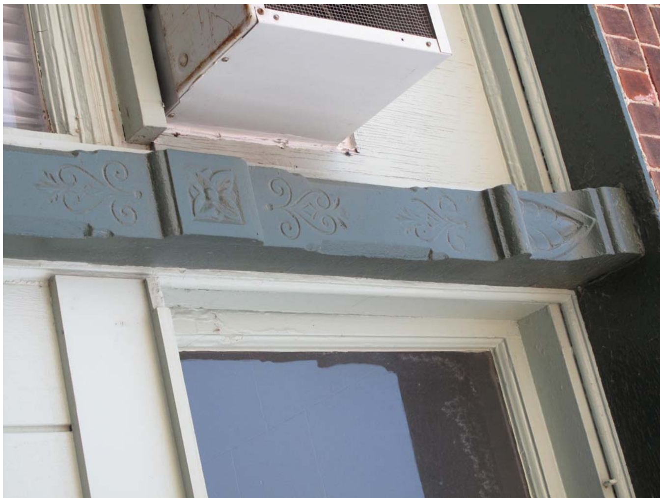
Photograph 92-00545-008 - Column detail on 217 storefront, looking southeast.