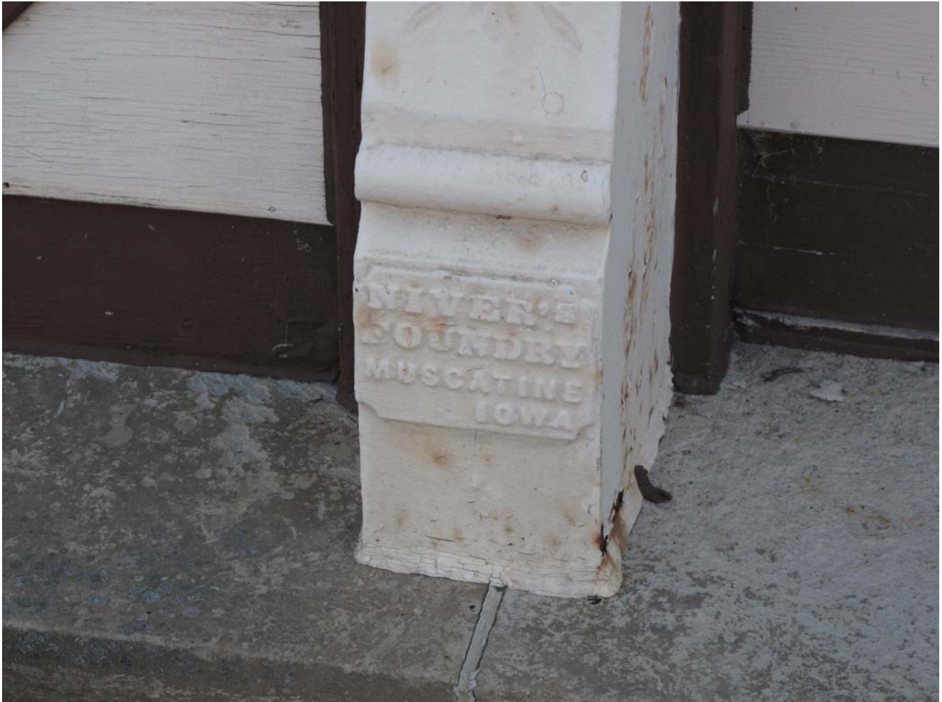
Photograph 92-00545-005 - Column detail on 213 storefront, looking south.