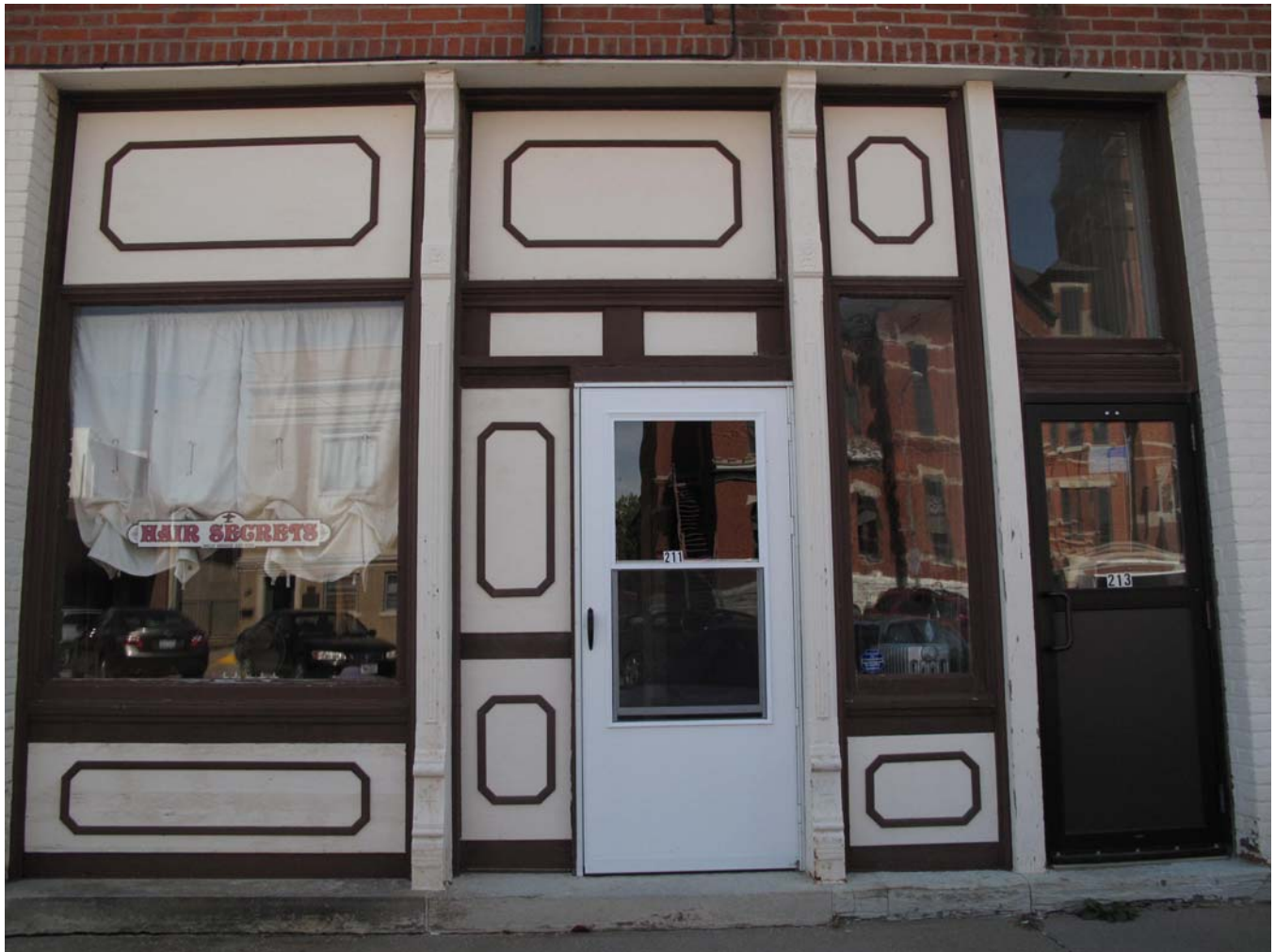
Photograph 92-00545-004 - 213 storefront, looking south.