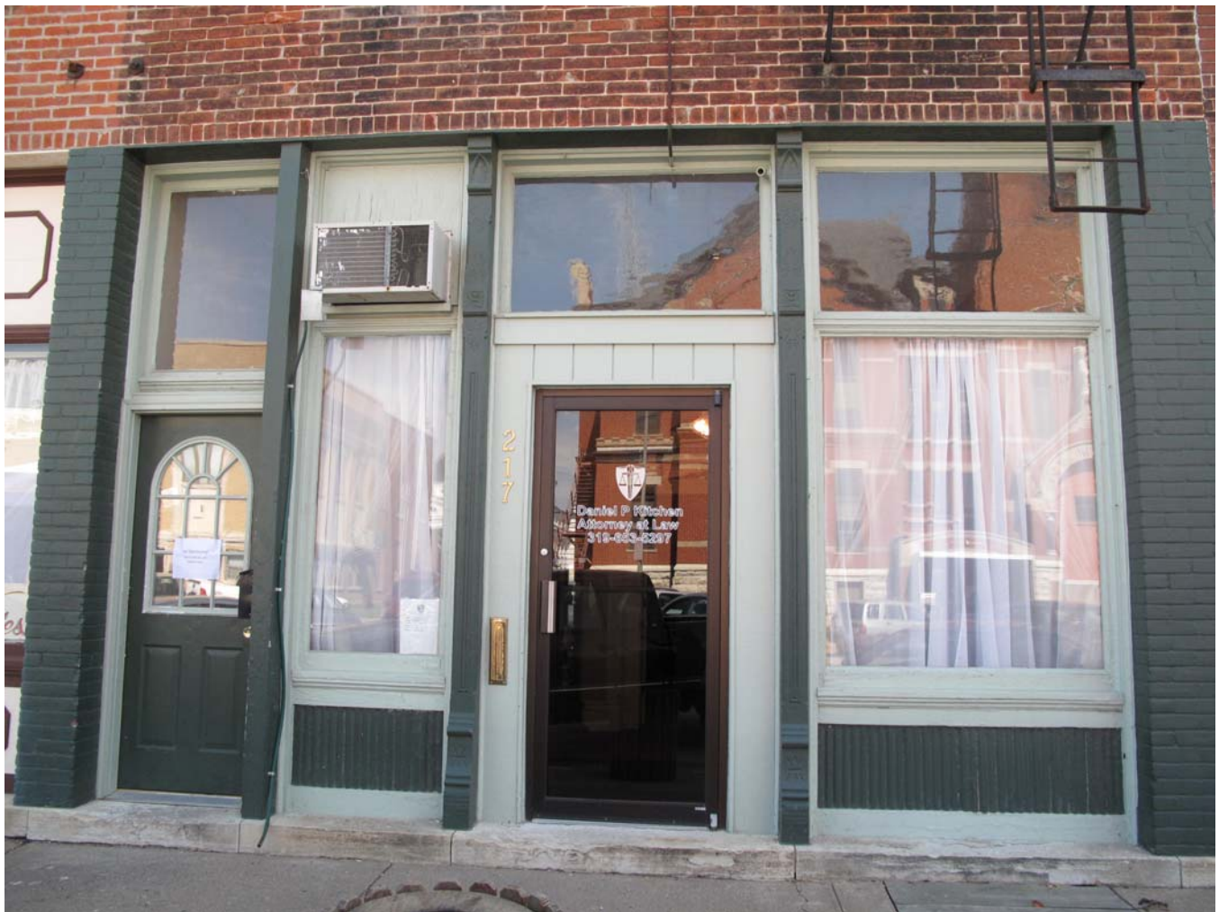
Photograph 92-00545-006 - 217 storefront, looking south.