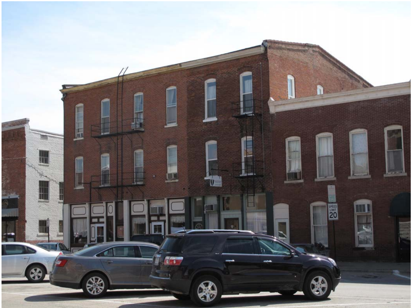
Photograph 92-00545-002 - Front (north) and west elevations, looking southeast.