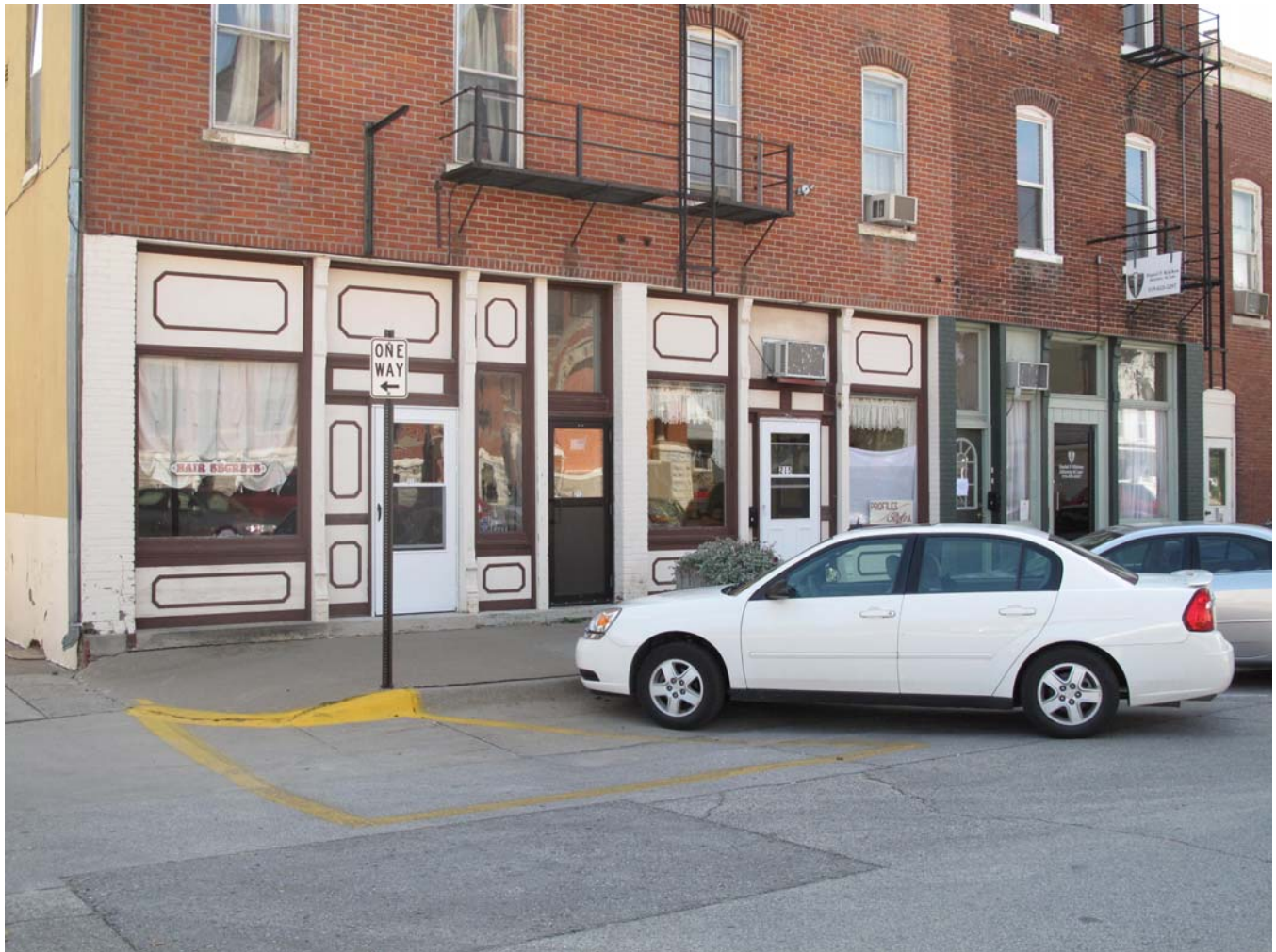
Photograph 92-00545-003 - Storefronts, looking southwest.