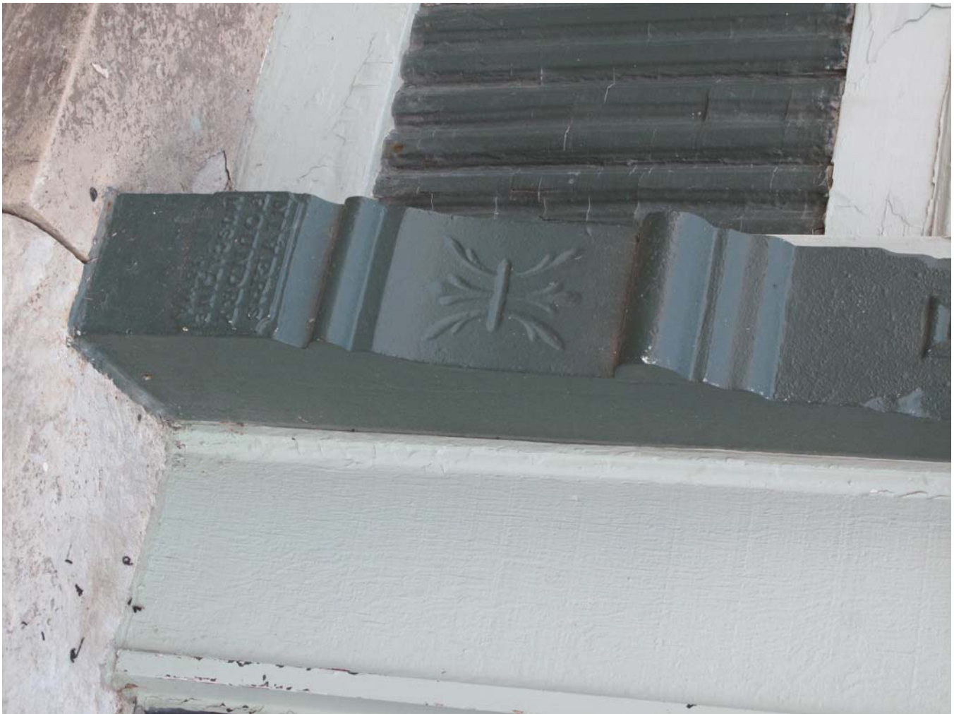
Photograph 92-00545-007 - Column detail on 217 storefront, looking southeast.