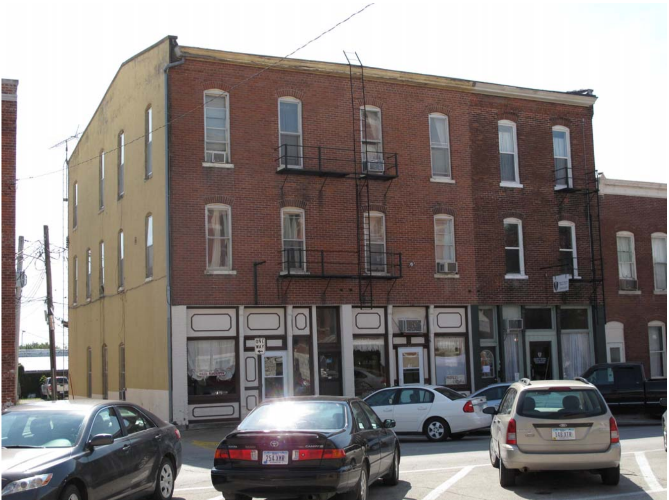
Photograph 92-00545-001 - East and front (north) elevations, looking southwest.