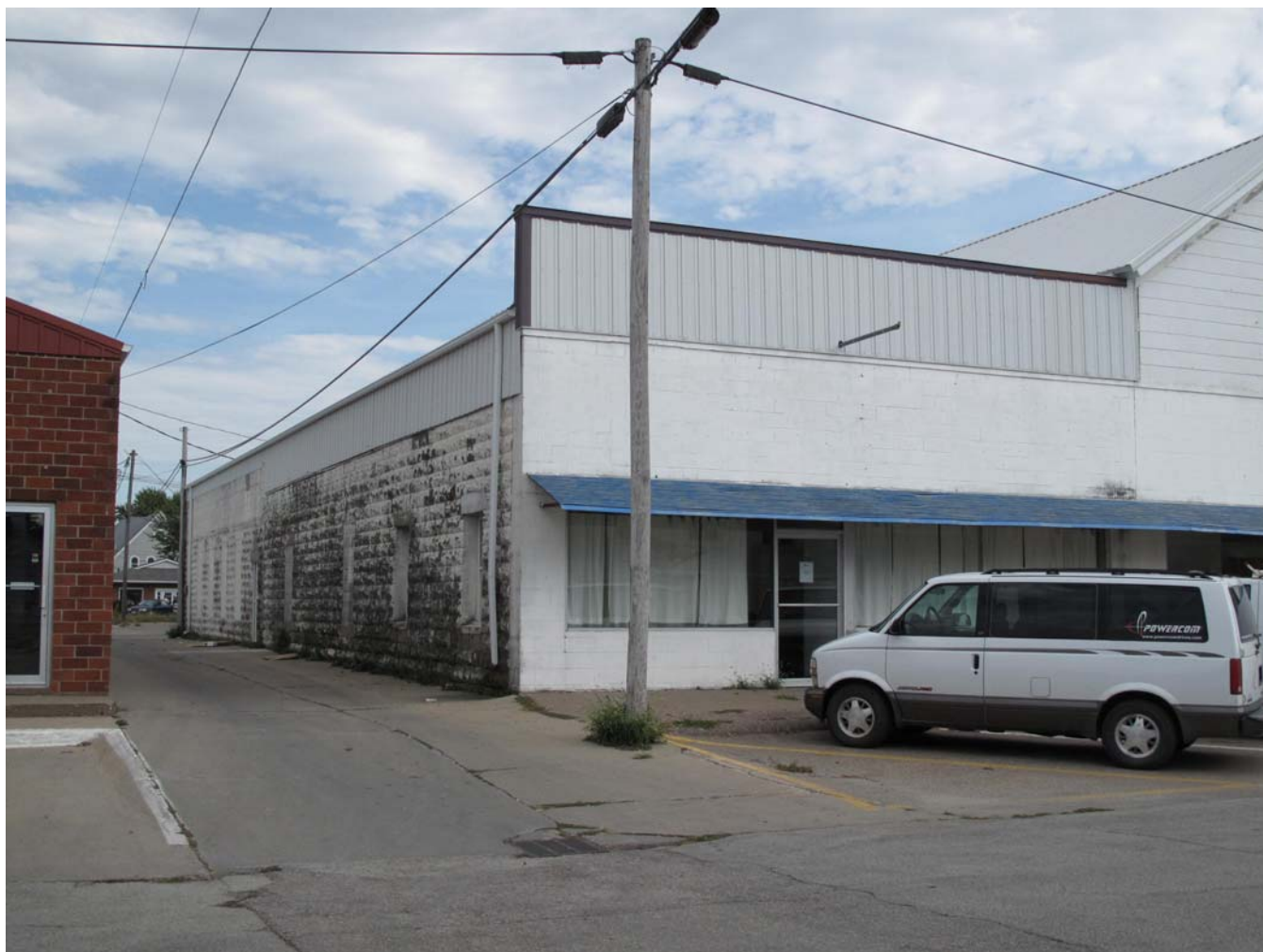
Photograph 92-00554-001 - North and west elevations, looking southeast