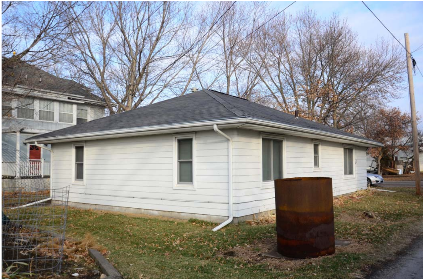
Photograph 92-00759-002 - House, looking northeast (December 2014)