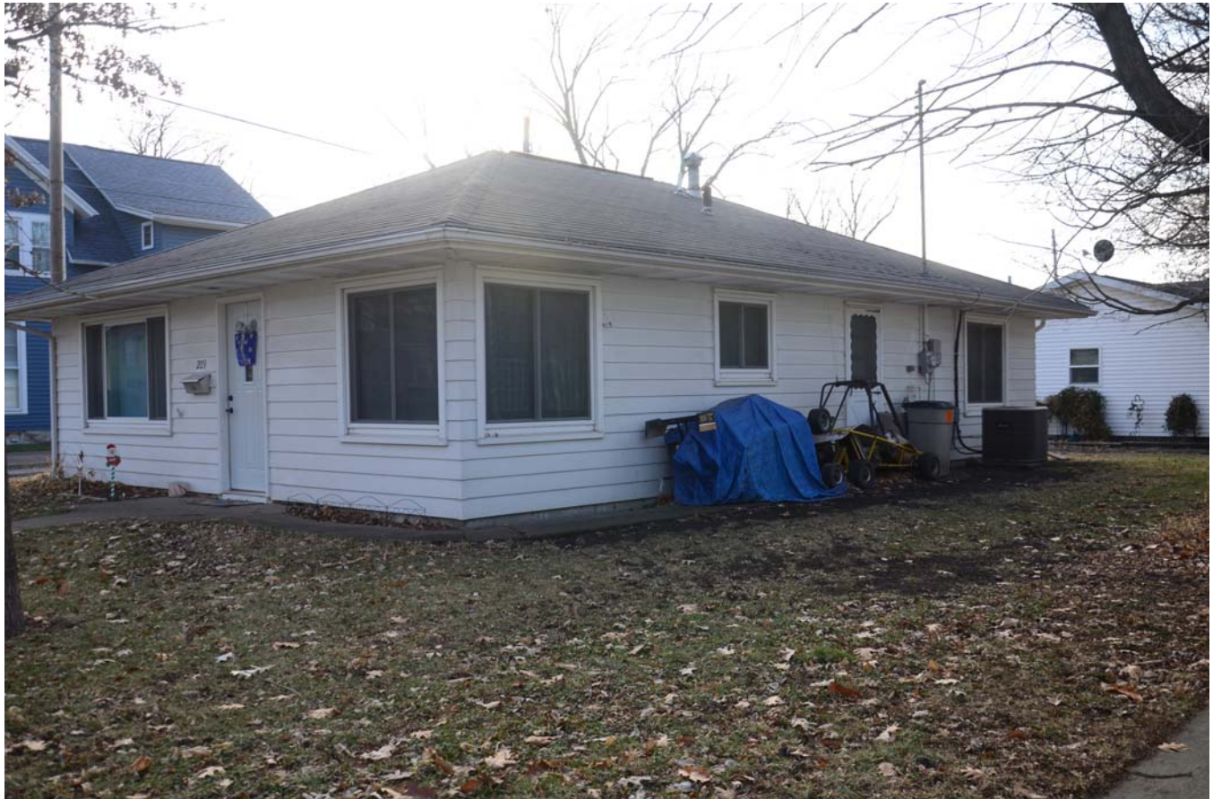
Photograph 92-00759-001 - House, looking northwest (December 2014)