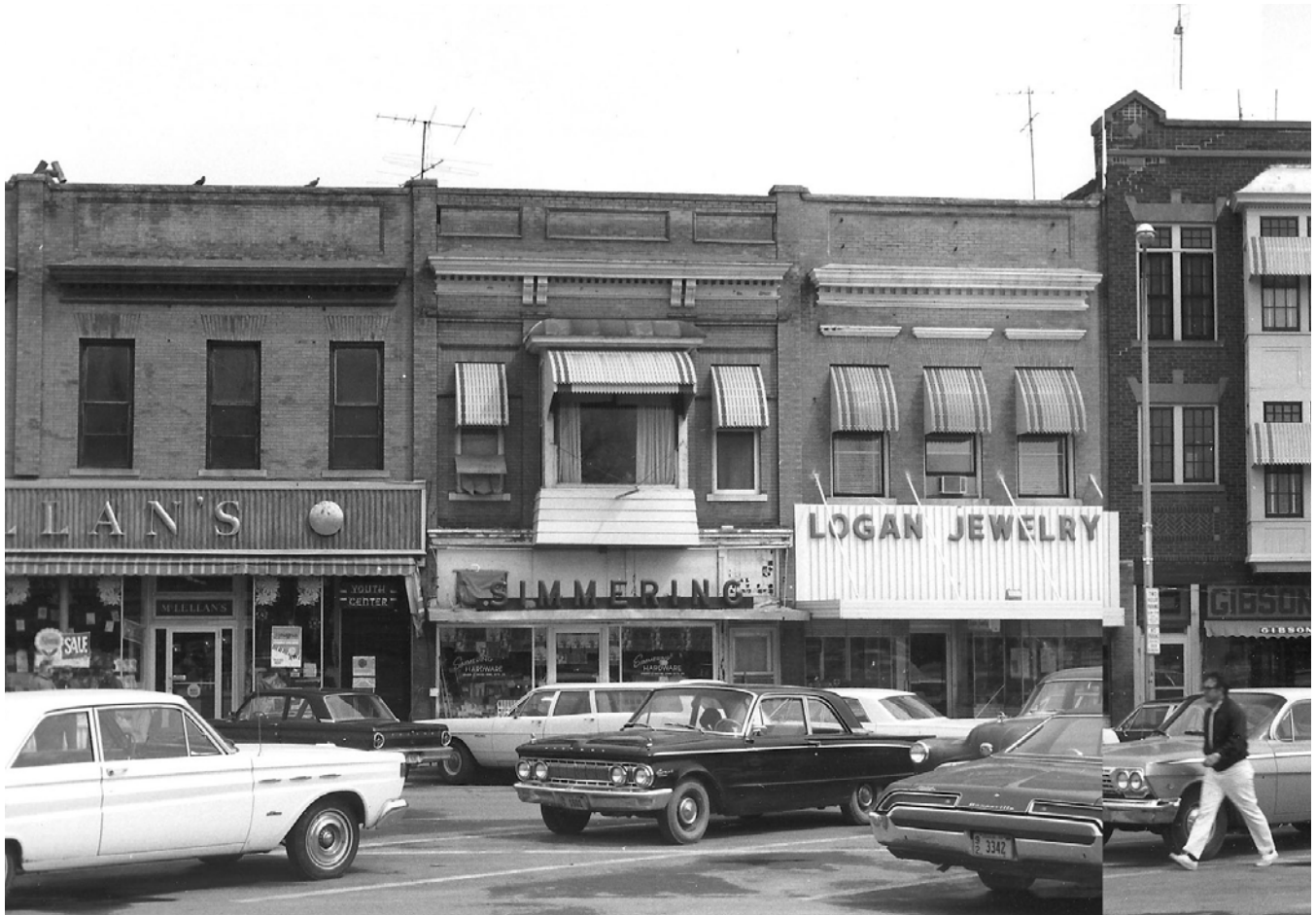
Building in 1971 (Wagner 1971)