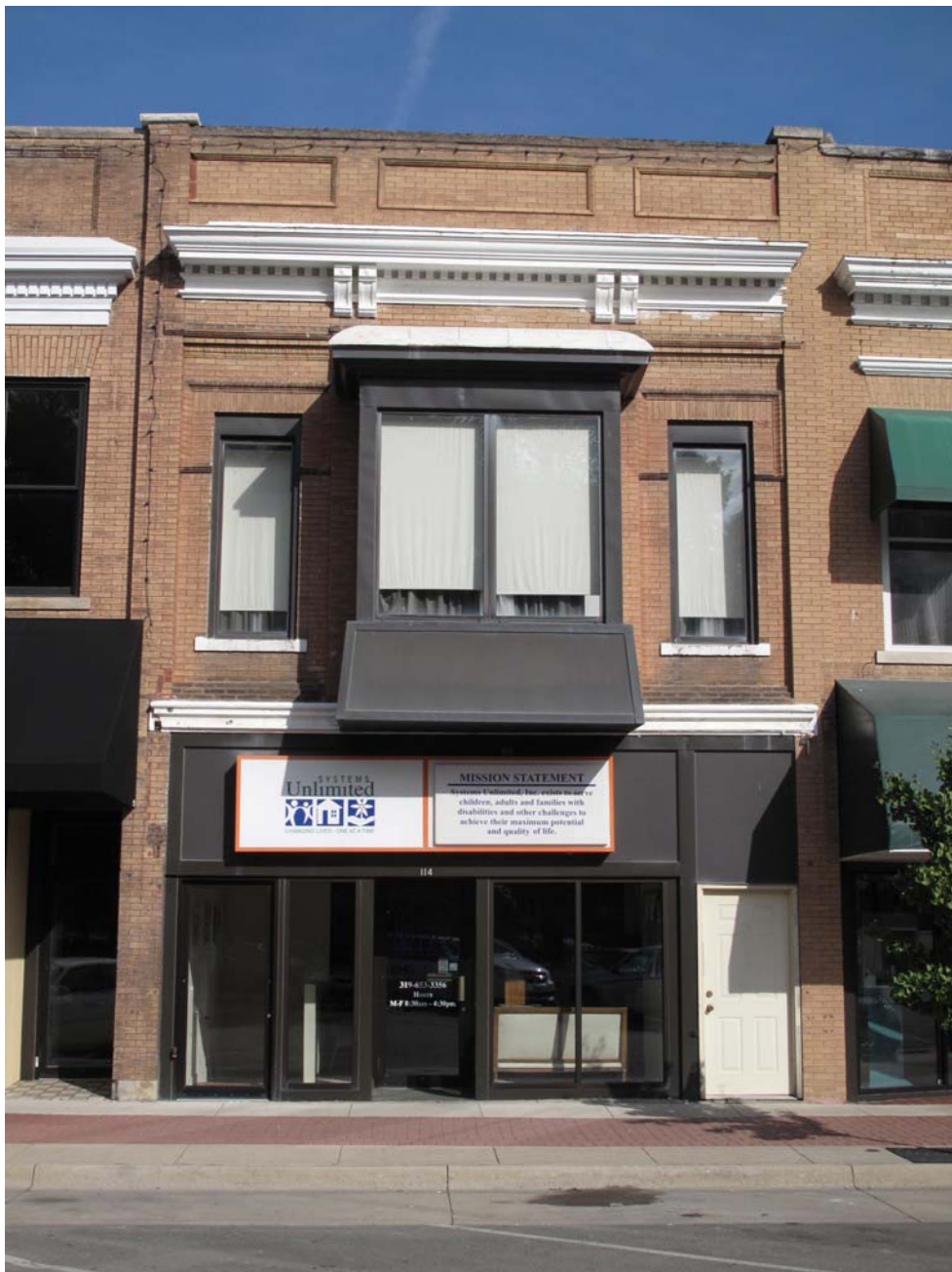
Photograph 92-00514-001 - West elevation, looking east