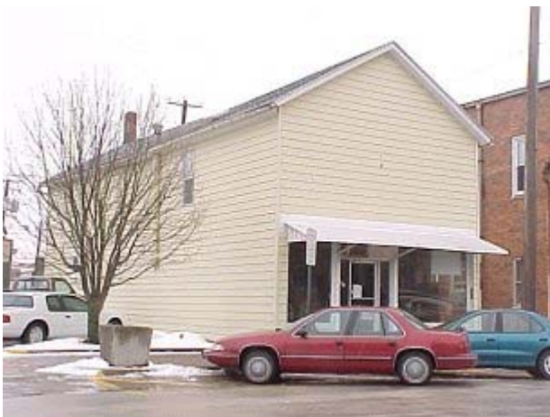
Assessor photo - prior to 2008 remodel