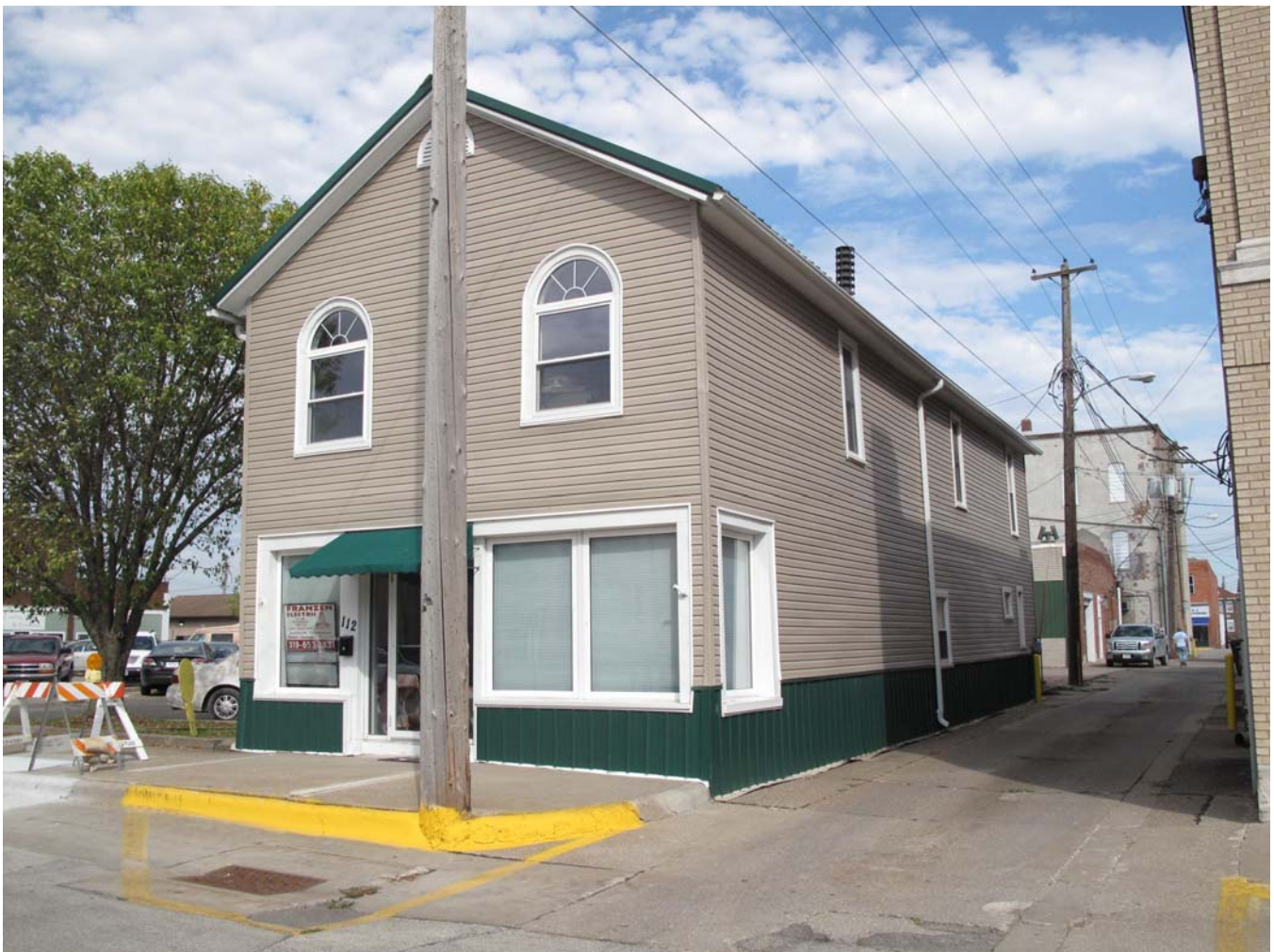
Photograph 92-00552-001 - West and south elevations, looking northeast