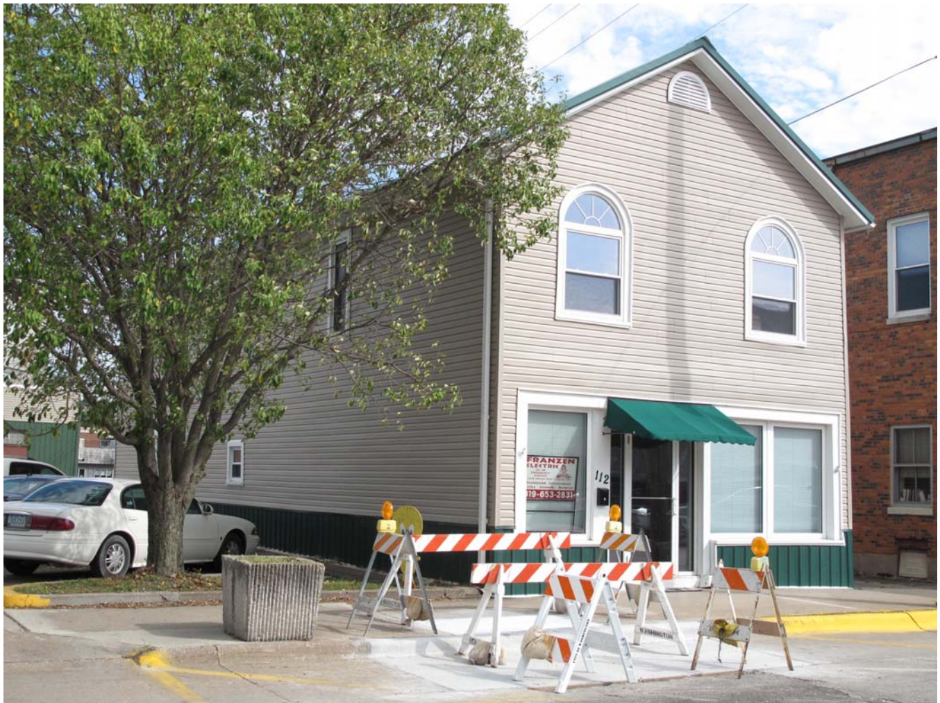
Photograph 92-00552-002 - North and west elevations, looking southeast