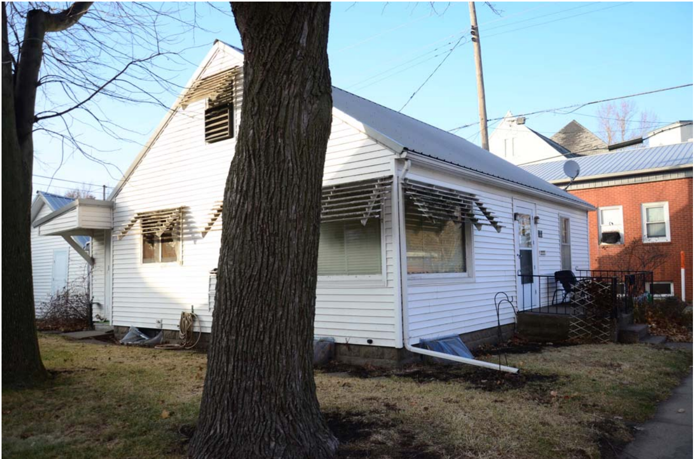
Photograph 92-00772-002 - House, looking northwest (December 2014)