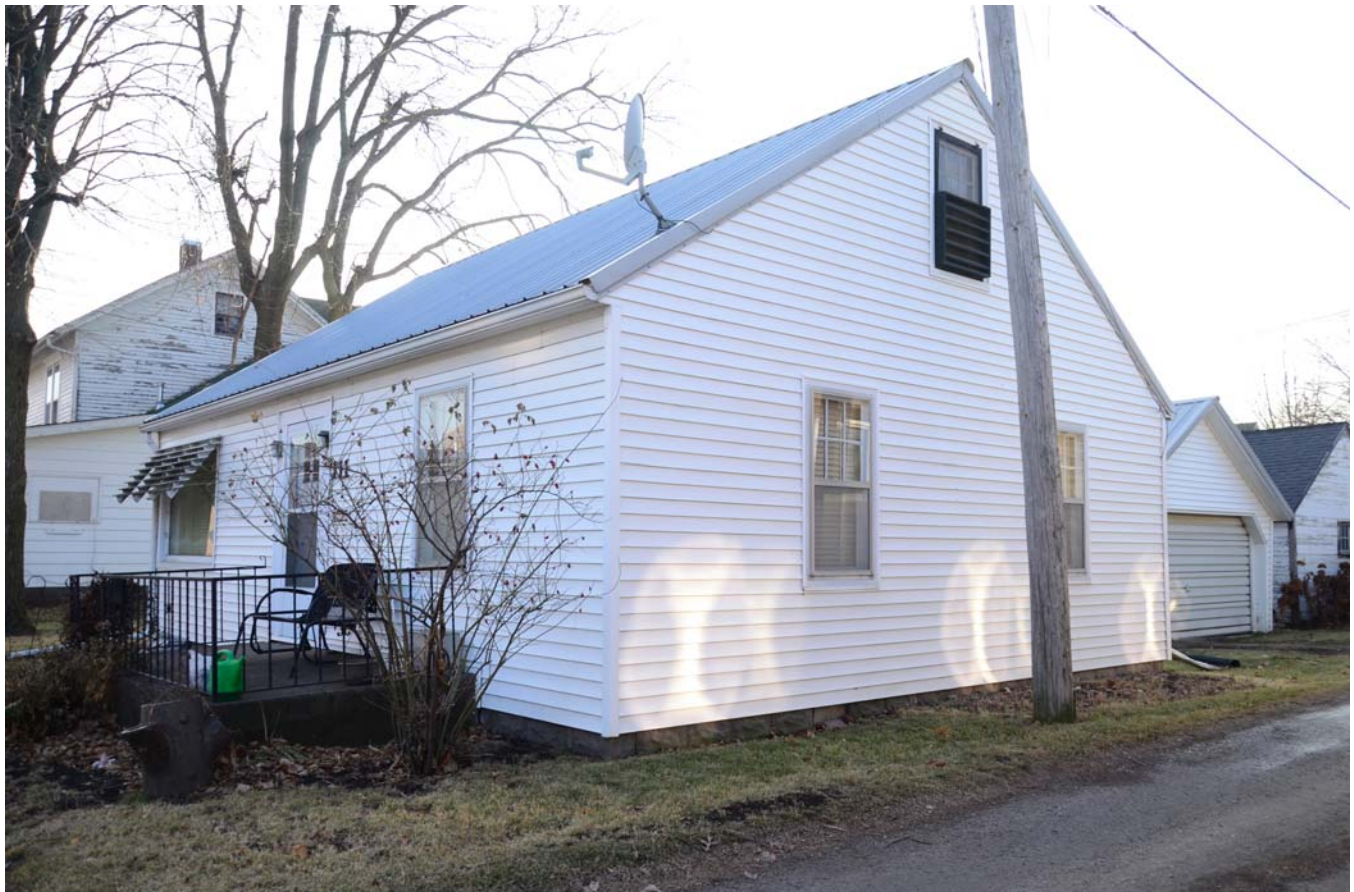
Photograph 92-00772-001 - House, looking southwest (December 2014)