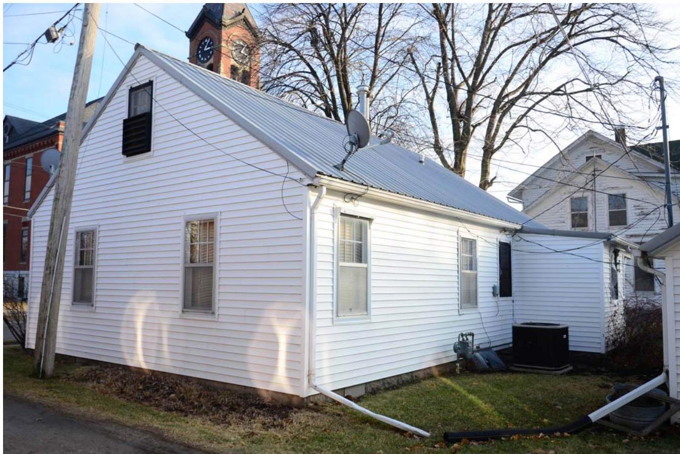
Photograph 92-00772-003 - House, looking northwest (December 2014)