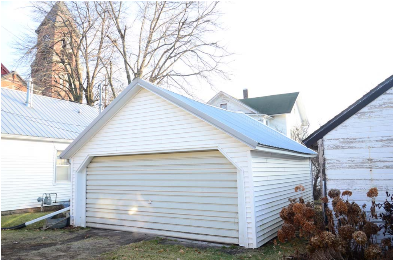
Photograph 92-00772-004 - House, looking northwest (December 2014)