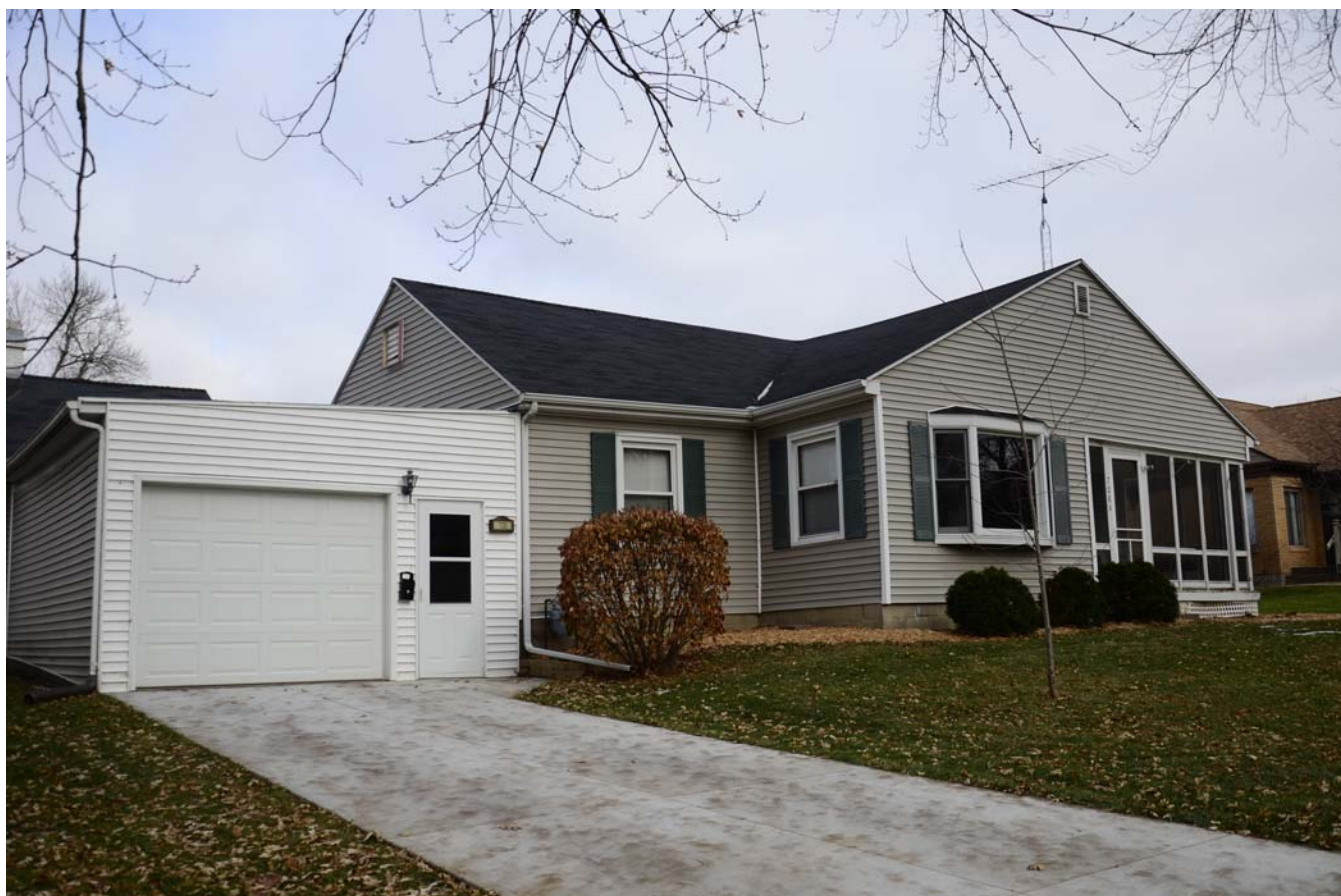
Photograph 92-00767-001 - House, looking northeast (December 2014)