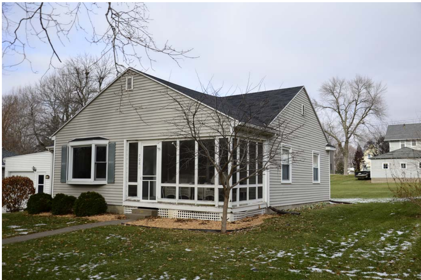
Photograph 92-00767-002 - House, looking northwest (December 2014)