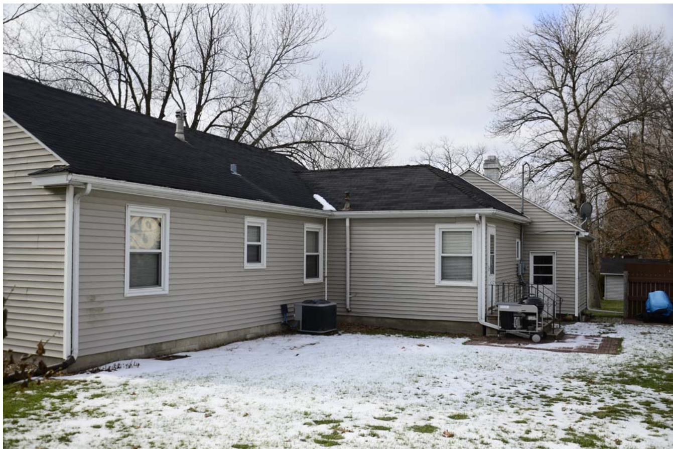
Photograph 92-00767-003 - House, looking southwest (December 2014)